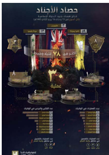
The infographic as it appeared in Al-Naba' weekly (Al-Naba' weekly, Telegram, November 25, 2021)

► An infographic published by ISIS summing up its activity around the world in the period between November 18 and November 24, 2021 , indicates that in this period, ISIS carried out 30 attacks in its various provinces in Asia and Africa, compared to 49 in the previous week. The largest number of attacks was carried out by ISIS's Khorasan Province (i.e., Afghanistan) (9). Attacks carried out in the other provinces: Iraq (8); Central Africa (5); Syria (3); West Africa (2); Pakistan (1); Sinai (1); and Somalia (1). A total of 78 people were killed and wounded in the attacks , compared to 206 in the previous week. The largest number of casualties was in Khorasan (26). The other casualties were in the following provinces: Iraq (20); West Africa (16); Syria (6); Sinai (3); Central Africa (3); Somalia (3); and Pakistan (1) (Al-Naba' weekly, Telegram, November 25, 2021).