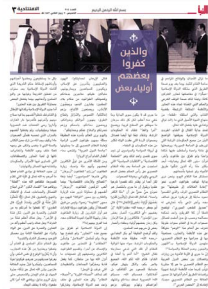
The article criticizing the rapprochement between Arab countries and Syria (Al-Naba' weekly, Telegram, November 25, 2021)