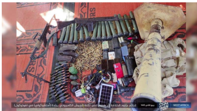
Weapons and ammunition seized by ISIS operatives during the attack on the Cameroonian army camp

exchange of fire. The other soldiers fled. ISIS operatives set the camp on fire, destroying heavy weapons and seizing weapons and ammunition.