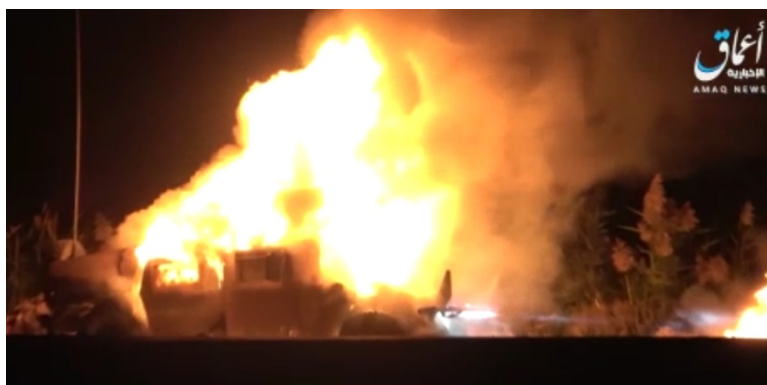
Peshmerga vehicle hit by the IED

► On November 27-28, 2021 , a group of Kurdish Peshmerga fighters was targeted by sniper fire in Kolajo, near the Iraq-Iran border. Four fighters were wounded. A little later, an IED was activated against a Peshmerga vehicle. Five fighters were killed, two of them officers (Kurdistan 24, November 28, 2021).