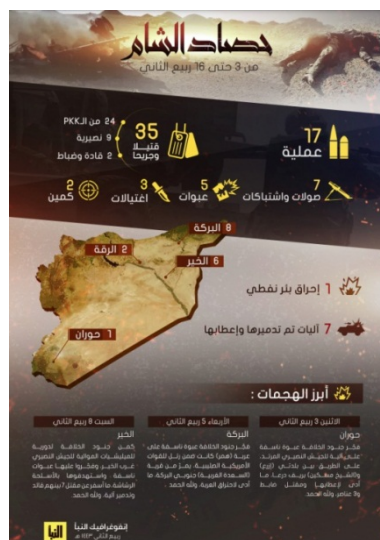
ISIS's attacks in Syria (Al-Naba' weekly, Telegram, November 25, 2021)

► ISIS's Al-Naba' weekly published an infographic summing up ISIS's attacks in Syria on November 8-21, 2021 . According to the infographic, ISIS carried out 17 attacks in the period in question: 7 attacks with light and heavy weapons, 5 IED attacks, 3 targeted killings, and 2 ambushes. A total of 35 people were killed and wounded in those attacks (24 SDF fighters, nine Syrian regime operatives, and two officers or commanders – no details were specified regarding the affiliation of the latter). Most of the attacks were in the Al-Hasakah Province (8). In addition, there were attacks in Deir ez-Zor (6), Al-Raqqah (2) and Hawran (1). One oil well was set on fire by ISIS, and seven vehicles were destroyed or put out of commission (Al-Naba' weekly, Telegram, November 25, 2021).