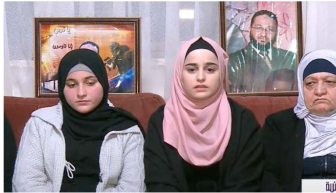
The terrorist operative's daughter interviewed by al-Jazeera TV, November 23, 2021.

you were like a lion and died the death of a martyr like a lion. You died the way you wished. Praise be to Allah [from] the son of a shaheed" (Nabadh website, November 21, 2021).