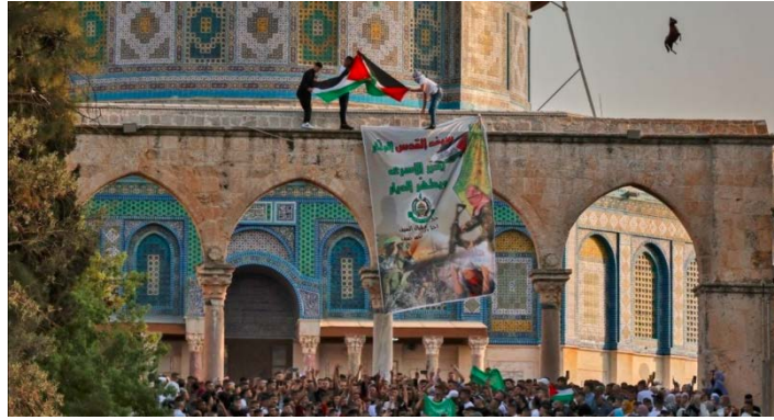
Sign supporting Hamas hung on the wall of the Deif mosque on the Temple Mount (QudsN Facebook page, July 20, 2021).