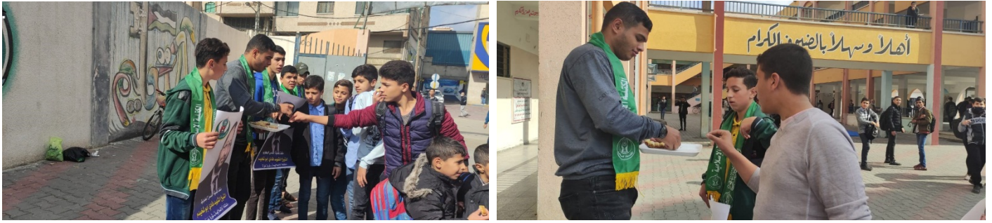
Activists of the Islamic Bloc ( Hamas' student faction) distribute candy at a school in the Gaza Strip (NPA website, November 21, 2021).