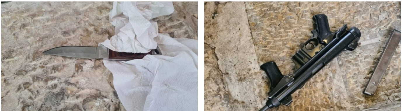
Right: The rifle used in the attack. Left: The knife found near the terrorist's body (Israel Police Force spokesman's unit, November 21, 2021).

► On the morning of November 21, 2021 , there was a shooting attack in the Old City of Jerusalem in which an Israeli civilian was killed and four Israelis were injured: one civilian critically, another seriously, and two policemen who sustained minor injuries. The shooter was a Palestinian armed with a rifle who went to the Chain Gate in east Jerusalem and shot indiscriminately at passersby. Police at the site shot and killed him. A knife was also found near his body (Israel Police Force spokesman's unit, November 21, 2021).