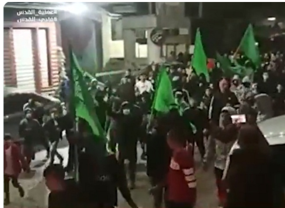
Right: Hamas operatives march through the Shuafat refugee camp. Left: Hamas flags and mourning notice hung in a wall of Abu Shekhidam's house.