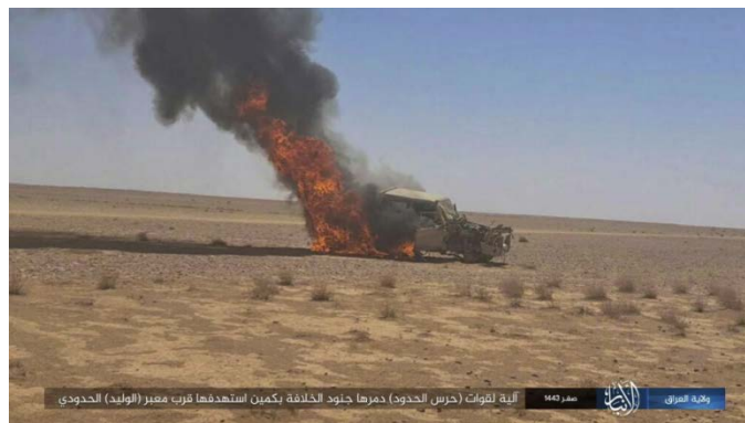
Right: The patrol vehicle on fire. Left: Three rifles seized by ISIS operatives (Telegram, September 1, 2021)

► On August 30, 2021 , an Iraqi government intelligence operative was abducted near the Al-Walid border crossing. He was interrogated by ISIS and then executed.