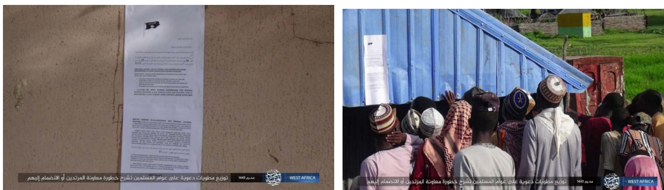
Residents looking at a poster put up by ISIS calling on them not to cooperate with the local authorities. Left: The wording of the poster (Telegram, September 1, 2021)

posters, which were translated into the local language (along with quotes from the Quran in Arabic), asked the residents not to cooperate with the Nigerian authorities (Telegram, September 1, 2021; Telegram, Al-Naba' weekly, September 2, 2021).