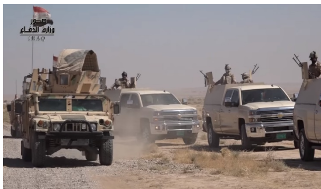
Some of the forces operating in the Hawi al-Azim region (Iraqi Defense Ministry, September 2, 2021)