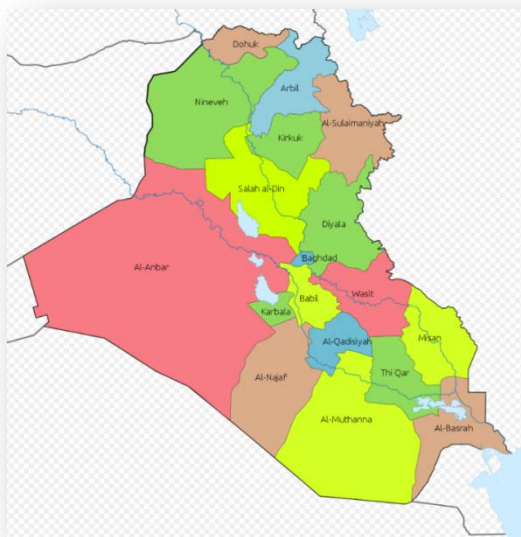
Provinces of Iraq (Wikipedia)