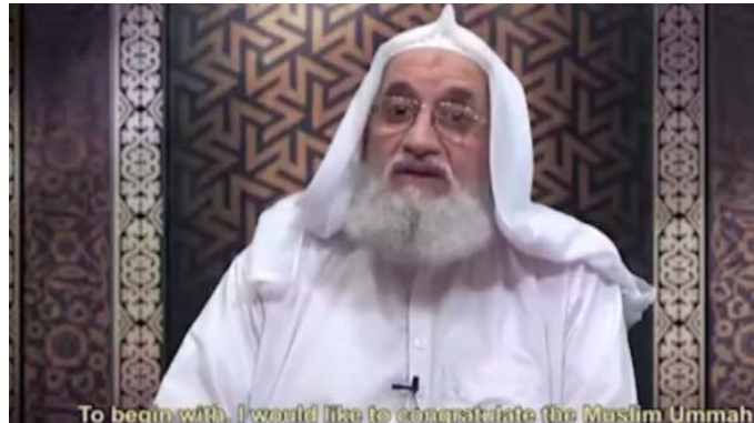
Al-Zawahiri in the video (Telegram, September 11, 2021)

according to the Quran, Muslims are forbidden to make an alliance with the Jews. According to him, the most important weapon of the Palestinians is the Islamic consciousness and as long as Israel controls Jerusalem and its environs it will continue to pay the price. He says that the fighting against Israel must be transferred to Israeli territory, since in the Gaza Strip and the West Bank Israel is the one who determines when and where the Palestinians are attacked. The jihad fighters are the ones who should determine when and where Israel is attacked.