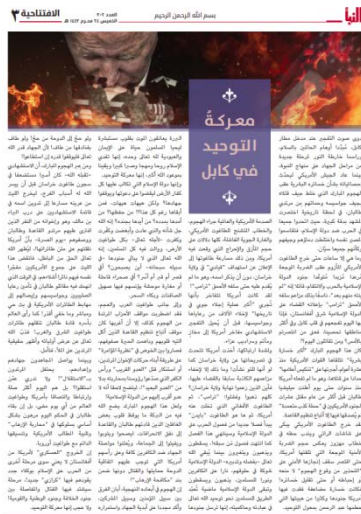
Article in ISIS's Al-Naba' weekly: US President Joe Biden with flames in the background (Al-Naba' weekly, Telegram, September 2, 2021)

◆ The attack proves the eternity of jihad and that the American withdrawal is another step in the war between the United States and Islam, in which it is using the Taliban as its executive arm in Afghanistan, while the Taliban presents itself as the liberator of the country. In the next stage, the division between ISIS and the national elements in Afghanistan will intensify, and this is not surprising, since this is a campaign for the Oneness of Allah.