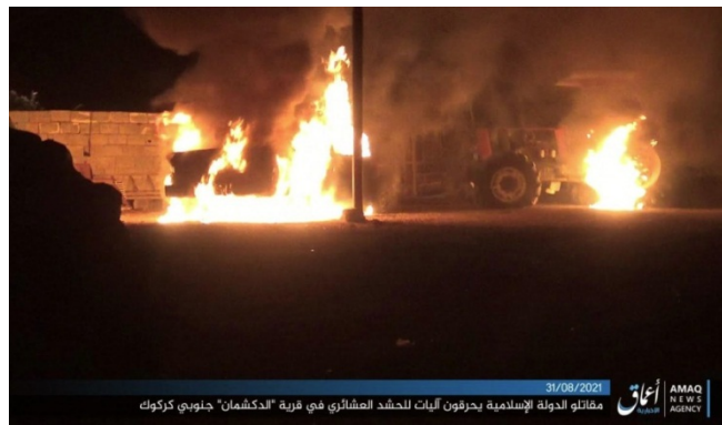
ISIS operatives setting fire to a vehicle and a house belonging to Tribal Mobilization fighters (Telegram, August 31, 2021)

► On August 30, 2021 , Tribal Mobilization fighters were attacked in a village in the Daquq region. After the attack, ISIS operatives took over the village, set fire to the house of a Tribal Mobilization fighter and caused heavy damage to houses and property.