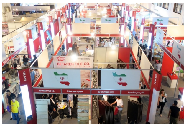
The Iranian booth in the 60 th International Trade Fair held in Damascus in September 2018. (IRNA, September 2, 2018)