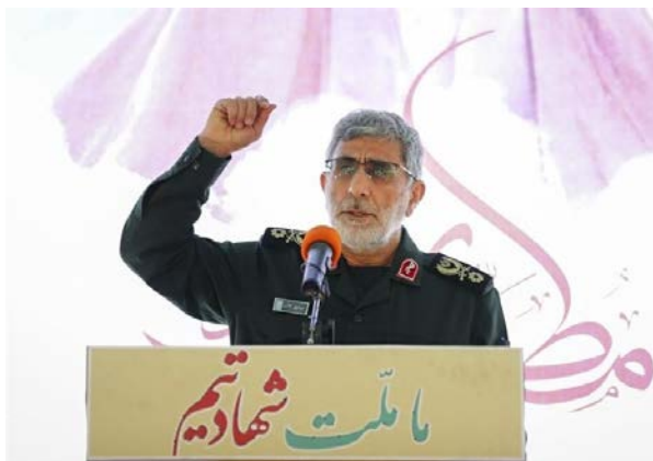
The commander of the IRGC's Qods Force. (Tasnim, May 29)

prepare for governing all of Palestine, including the 1948 territories. He advised all the Zionists to leave Palestine and purchase the homes they once sold in Europe, the United States, and other countries, before their prices rise. Qa'ani added that during the last conflict, the Palestinians avoided firing rockets toward much of the infrastructure in “occupied Palestine,” because soon enough, they will be able to use that infrastructure themselves (Tasnim, May 29).