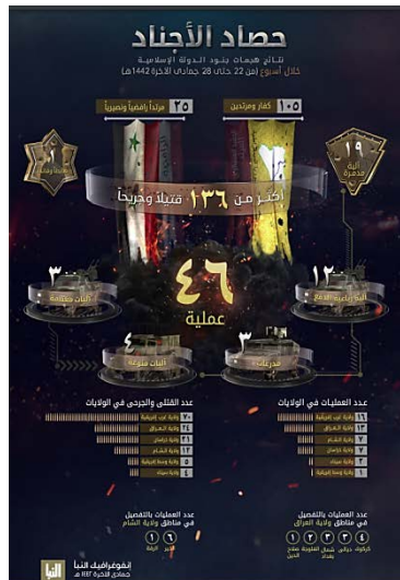
The infographic (Al-Naba' weekly, Telegram, February 11, 2021)