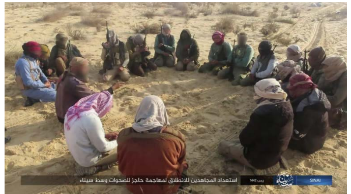
Right: ISIS operatives before setting out to the attack. Left: ISIS operatives attacking the fighters of the tribal militia, who are running for their lives