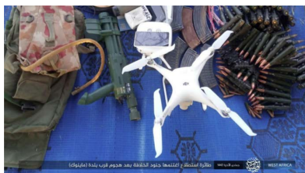
Right: Drone, weapons and ammunition that fell into the hands of ISIS operatives in the attack. Left: Vehicle seized by ISIS operatives in the attack