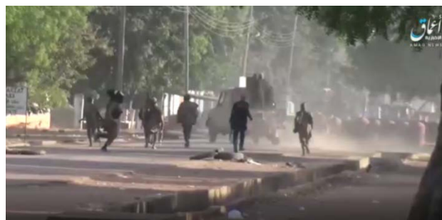
ISIS operatives taking control of the town of Askira (Telegram, February 12, 2021)