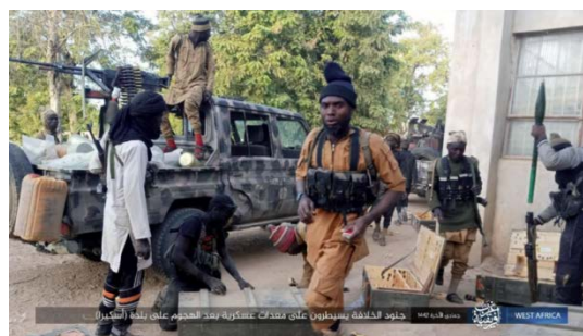
Right: ISIS operatives collecting ammunition that they seized (Telegram, February 12, 2021). Left: ISIS operatives setting fire to Nigerian army barracks in the town of Askira (Telegram, February 12, 2021).