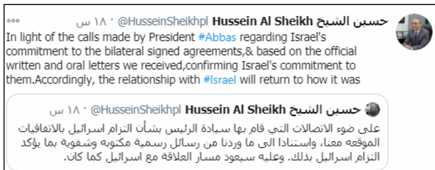
Hussein al-Sheikh's announcement of the return of relations with Israel to the status quo ante (Hussein al-Sheikh's Twitter account, November 17, 2020).

held regarding Israel's commitment to the agreements signed with the Palestinians . It was based on verbal and written communications confirming Israel's commitment to the agreements (Hussein al-Sheikh's Twitter account, November 17, 2020); Wafa, November 17, 2020). Hussein al-Sheikh is a member of Fatah's Central Committee, chairman of the General Authority for Civil Affairs, and responsible for civilian coordination with Israel. He enjoys the status of minister although he is not formally a member of Muhammad Shtayyeh's government.