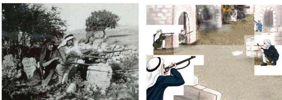
( Arabic Language, Grade 5, Part 2, 2017 ) ( Arabic Language, Grade 5, Part 2, 2019 )