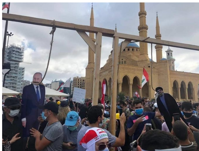
Presentation of Hezbollah leader Hassan Nasrallah (right) and Speaker of the Parliament of Lebanon Nabih Berri (left) hanging in effigy

overthrow the regime” and “Get out, you are all murderers”. Slogans condemning Hezbollah (“Hezbollah is a terrorist organization”) and calls for the demilitarization of Beirut were also heard. The calls against Hezbollah were made primarily because it is a key component of Lebanon’s sectarian regime, but also in view of the profound suspicion that Hezbollah was responsible for the disaster that befell Beirut.