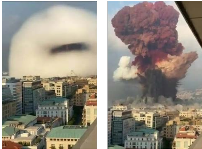
The moment of the explosion at the Port of Beirut

► According to initial reports, the explosion occurred in warehouse number 12 at the Port of Beirut, which was used for storing about 2,750 tons of ammonium nitrate (a chemical with a high nitrogen content, used as an agricultural fertilizer; it is also used for manufacturing explosives). The ammonium nitrate arrived at the Port of Beirut by ship in October 2013 1 . The ship was seized by the Lebanese authorities and the ammonium nitrate remained at the port. The actual cause of the explosion is not yet clear and the issue is expected to be investigated. The official version (whose reliability is unclear) indicates a fire that broke out as a result of renovation work in warehouse number 12.