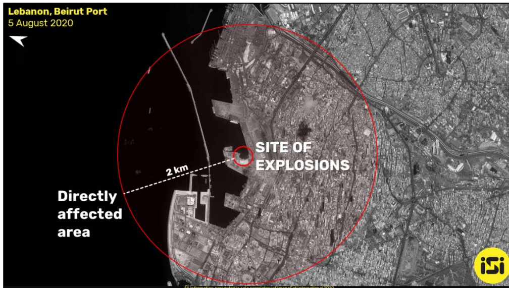
The area in west Beirut (mostly Sunni), which was directly affected by the explosion