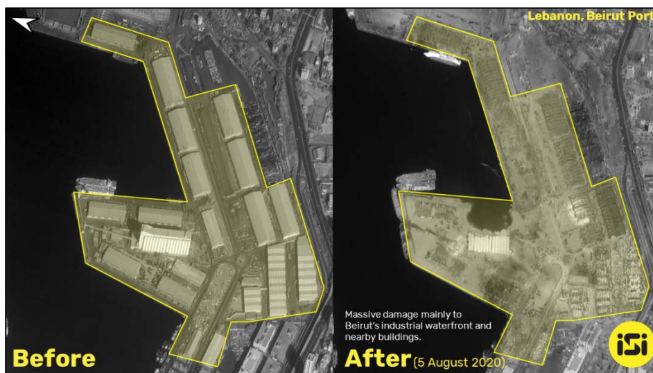
The Port of Beirut before (left) and after the explosion (right)

On the afternoon of August 4, 2020, there was a violent explosion in the Port of Beirut. The explosion killed more than 158 people and injured more than 6,000 . Scores of people are still missing, buried under the rubble of houses (reports from the Lebanese Ministry of Health, updated to August 8, 2020). As a result of the explosion, the Port of Beirut was heavily damaged, about 8,000 buildings were damaged, about 250,000 people were left homeless and tens of thousands of people lost their property and livelihoods. The damage from the explosion is estimated at tens of billions of dollars.