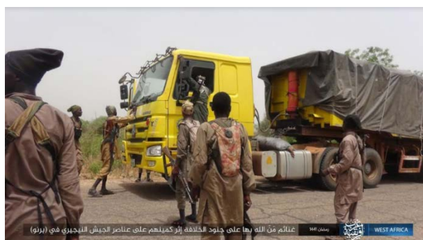
Nigerian army tanker and another vehicle seized by ISIS operatives (Telegram, May 8, 2020)

► On May 6, 2020 , five mortar shells were fired at a Nigerian army camp about 50 km southeast of Damaturu, the capital of Yobe State. According to ISIS, accurate hits of the target were observed (Telegram, May 7, 2020).