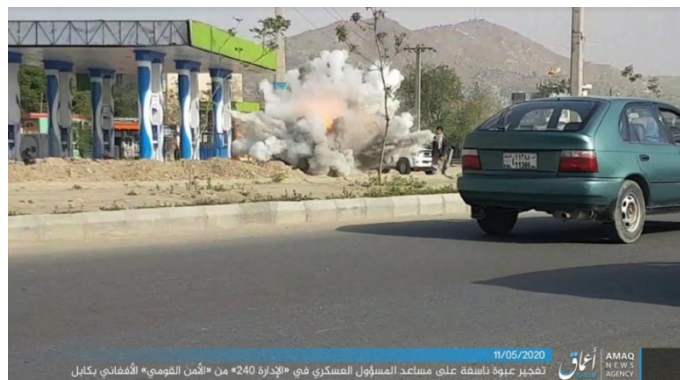
IED activated against the vehicle of a senior officer in the Afghan NDS (Telegram, May 11, 2020)

were activated against them. At least 11 security personnel were killed or wounded (Telegram, May 11, 2020).