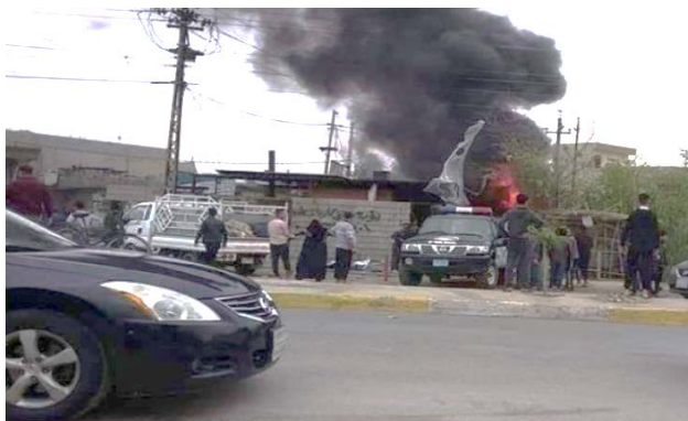
Explosion of the IED in the Al-Ma'alef area, in south Baghdad (glgamesh.com, May 10, 2020)

In the ITIC's assessment, the combined attack in Baghdad was intended to cause as many casualties as possible among the Shiite population, undermine security in the Iraqi capital, and signal to the Iraqi regime and the entire Iraqi public that ISIS's audacity was growing stronger and its operational capabilities were improving . Even if these goals were not achieved in full, the attacks indicate that concurrently with its "routine" guerrilla activity, ISIS strives to carry out showcase attacks with political and media repercussions in the Iraqi arena.