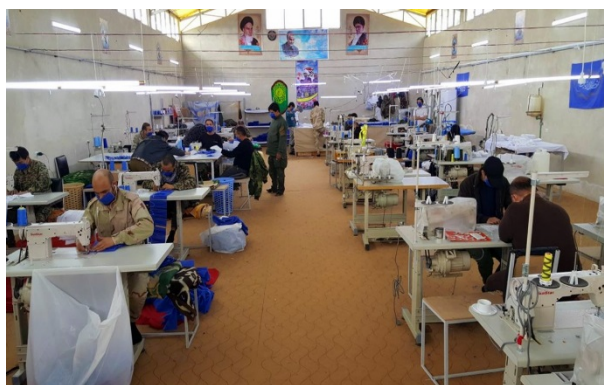
Manufacture of protective masks and gloves by Fatemiyoun Brigade fighters in Syria