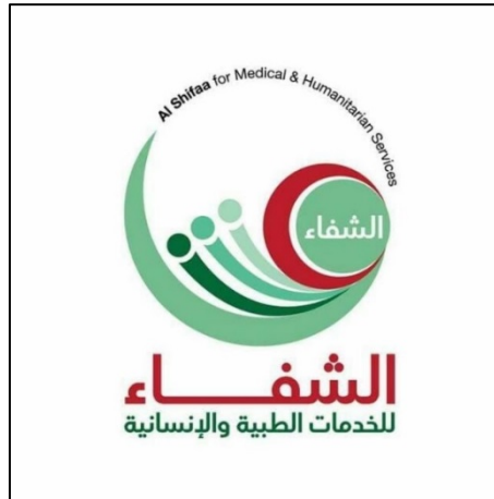
Emblem of the Shifa Association for Medical and Humanitarian Services (Facebook page of the Shifa Association in Sidon, January 10, 2020)