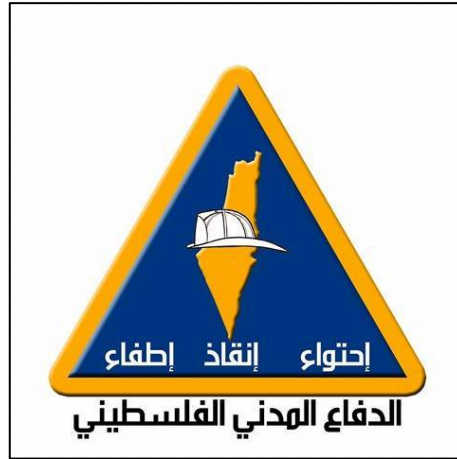
Emblem of the Palestinian Civil Defense (Facebook page of the Lebanese branch of the Palestinian Civil Defense in Lebanon, January 23, 2017)