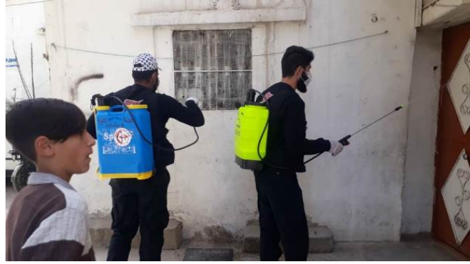
Right: Disinfection campaign of the PFLP youth movement in the Al-Jalil refugee camp. Left: Distribution of food for the needy by the Palestinian Civil Defense in the Al-Jalil refugee camp