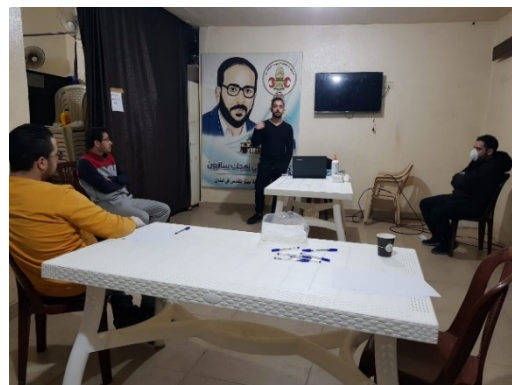
Right: PIJ-led training workshop in the Shatila refugee camp on the fight against COVID-19 (Shababeek, March 26, 2020). A picture of PIJ founder Fathi Shiqaqi is seen in the background. Left: Disinfection campaign in the Shatila refugee camp (website of Group 194, March 18, 2020)