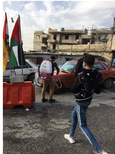
Taking temperatures at a Fatah checkpoint at the entrance to the Mieh Mieh refugee camp (March 23, 2020)