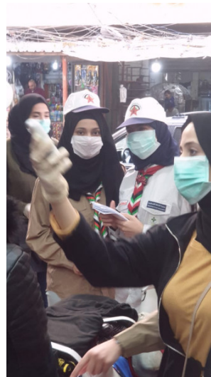
Members of the DFLP youth movement distributing leaflets and taking temperatures in the Beddawi camp