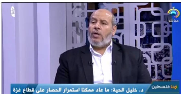
Senior Hamas figure Khalil al-Haya interviewed by al-Aqsa TV (Shehab Facebook page, March 23, 2020).

► Khalil al-Haya, deputy chairman of the Hamas political bureau, elaborated for an al-Aqsa TV interviewer about what Hamas had done to fight coronavirus. He also accused Israel of responsibility for the spread of coronavirus in the Gaza Strip ( Hamas website, March 23, 2020).