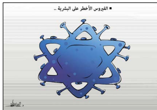
Anti-Semitic cartoon by Gazan cartoonist Alaa al-Laqta. The Arabic reads, "The virus most dangerous to humanity..." (Palinfo Twitter account, March 15, 2020).