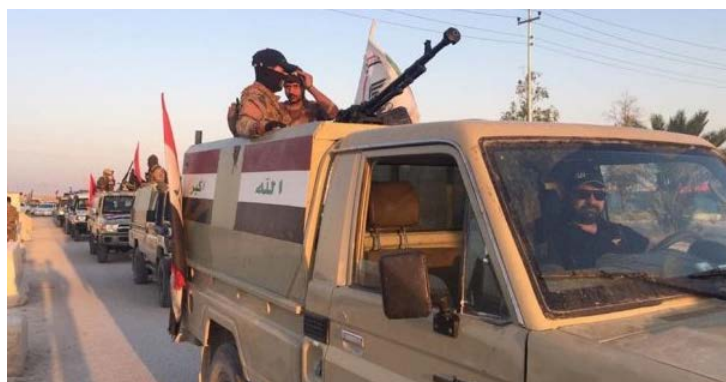
Motorized Popular Mobilization force during an operation against ISIS

► On February 28, 2020 , a Popular Mobilization force captured five wanted “terrorist operatives” (presumably ISIS operatives) in Al-Anbar Province, about 30 km southeast of the Iraqi-Syrian border (al-hashed.net, February 28, 2020).