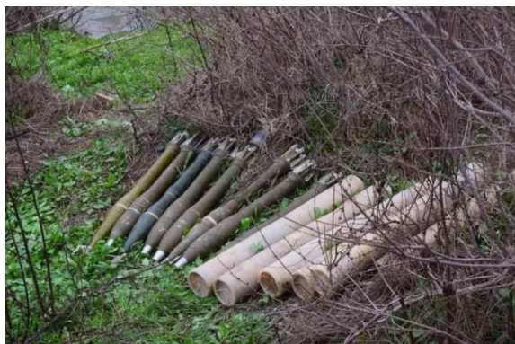
Rockets found by an Iraqi Interior Ministry force in ISIS “guesthouses” in the Kirkuk Province (Al-Sumaria, February 26, 2020)