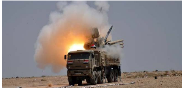
Right: Syrian army Russian anti-aircraft system in the battle zone (SANA, March 1, 2020). Left: Turkish army drone on fire after being hit by Syrian army fire in the airspace over Saraqeb (SANA, March 1, 2020).

Following the killing of the Turkish soldiers, the Turkish defense minister announced (March 1, 2020) the opening of a military campaign against the Syrian army, called Operation Spring Shield . The minister pointed out that Turkey would act against the attacking regime by virtue of its right of self-defense. However, Turkey has no desire to confront Russia (TRT World, March 1, 2020; Anadolu, March 2, 2020). Turkish President Erdoğan announced that Turkey would not target Russia and Iran and would not attack them . The purpose of the operation is to destroy targets of the Syrian regime , whose forces were attacking the Turkish forces (TRT World, March 1, 2020). At the same time, it was agreed to hold a meeting between the Russian and Turkish presidents in Moscow on March 5, 2020.