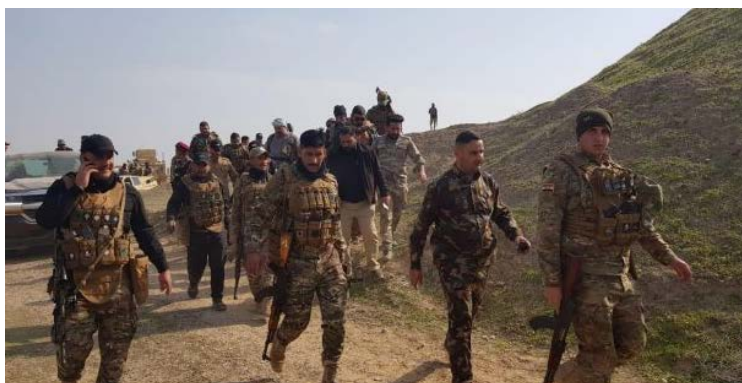
Joint force of the Popular Mobilization and the Iraqi army during activity against ISIS northeast of Fallujah