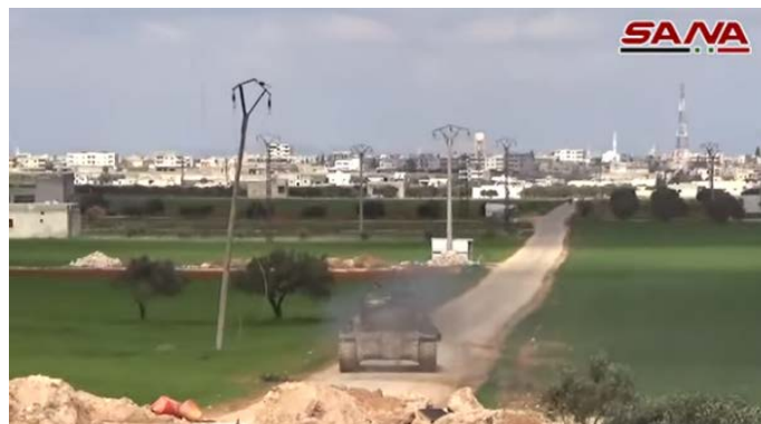
Syrian army tank entering Saraqeb (SANA, March 2, 2020)

► In the ITIC's assessment, the takeover of Saraqeb once again by the Syrian army was carried out relatively easily , without any significant effort on the part of the Headquarters for the Liberation of Al-Sham and the other rebel organizations to defend the city. Upon retaking it, the Syrian army regained control of the M-5 highway section passing through the eastern part of the city (Khotwa, March 3, 2020).