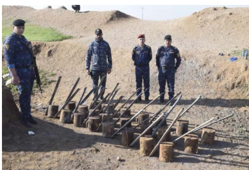
The Iraqi forces near the IEDs that were hidden in plastic containers (Facebook page of the Iraqi Ministry of Defense, February 29, 2020)