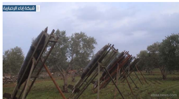
Rockets of the Headquarters for the Liberation of Al-Sham launched at targets of the Tiger Forces under the command of Col. Suhail Hassan in the southern Idlib region (Ibaa, February 29, 2020)

► On March 1, 2020, the Headquarters for the Liberation of Al-Sham and the other rebel organizations took over two additional areas in the south and southwest of the Idlib region (see map). Turkish drones reportedly attacked Syrian army reinforcements which were sent to the battle zones. In the drone attacks, Syrian army APCs were destroyed and several soldiers were killed (Khotwa, March 1, 2020).