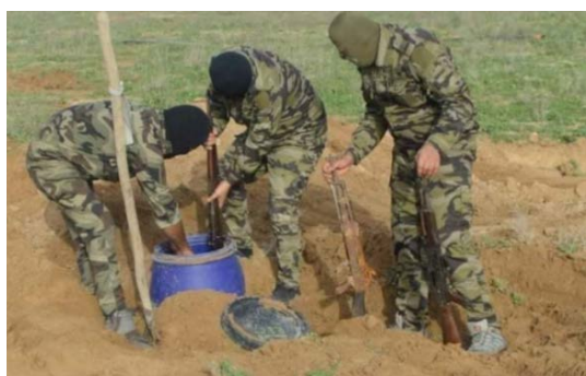
Popular Mobilization operatives removing a plastic container, inside which ISIS weapons were hidden (al-hashed.net, February 28, 2020)

► On February 29, 2020 , Iraqi security forces operating west of Samarra (about 100 km northwest of Baghdad) located 38 IEDs inside containers. The IEDs were detonated in a controlled manner (Facebook page of the Iraqi Ministry of Defense, February 29, 2020).