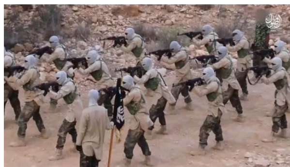
Right: Physical training of ISIS's Somalia Province operatives. Left: Light weapons training of Somalia Province operatives (Telegram, February 28, 2020)