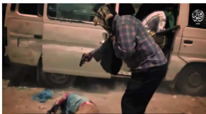
Execution of a Somali security forces operative (Telegram, February 28, 2020)