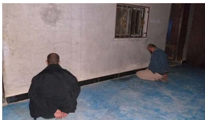
Right: Two ISIS operatives detained by the SDF (SDF Press, March 1, 2020). Left: Light arms and documents found in the possession of the two ISIS operatives (SDF Press, March 1, 2020)