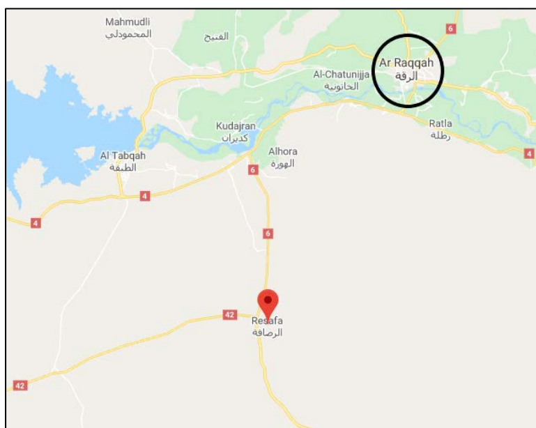
The ambush area in Al-Rasafah (Google Maps)