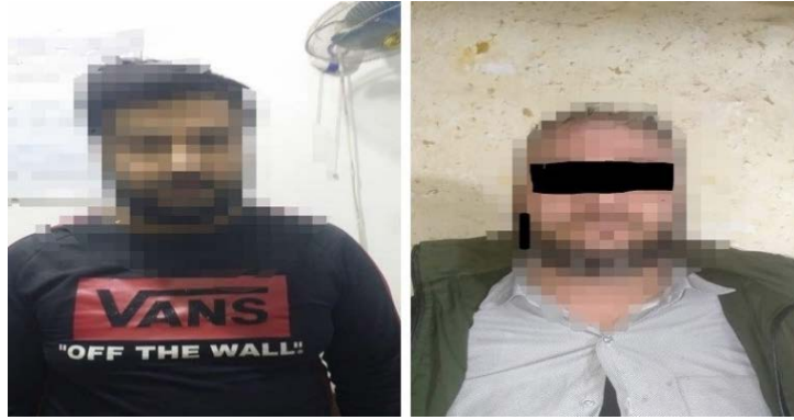
The two ISIS operatives detained in Baghdad (Iraqi News Agency, January 11, 2020)