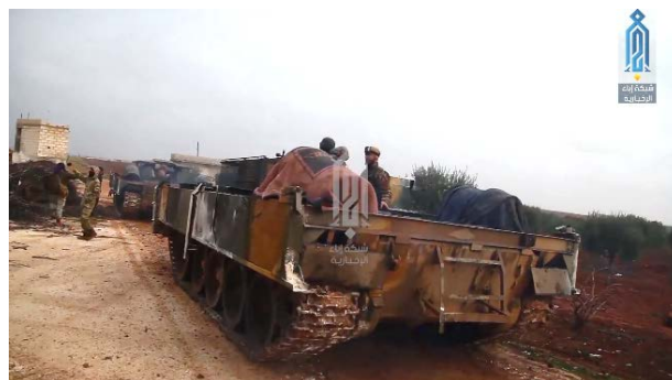
Operatives of the Headquarters for the Liberation of Al-Sham during the attack against the Syrian army (Ibaa, January 8, 2020)