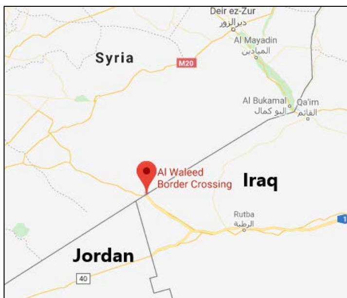
Al-Walid crossing, between Iraq and Syria