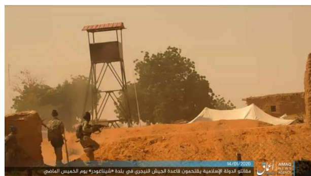
Right: ISIS operatives raiding the Nigerian army base. Left: ISIS operatives exchanging fire with Niger soldiers (Telegram, January 14, 2020)