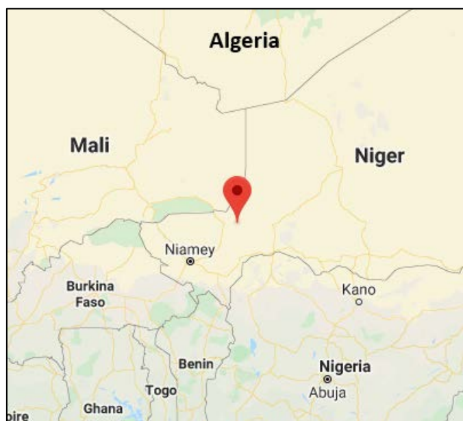
The area of the ambush

► On January 9, 2020 , ISIS operatives ambushed Niger Border Police forces in western Niger, about 250 km northeast of the capital Niamey (about 75 km southeast of the Niger-Mali border). A total of 14 soldiers were killed. In addition, vehicles, weapons and ammunition were seized (Telegram, January 14, 2020).