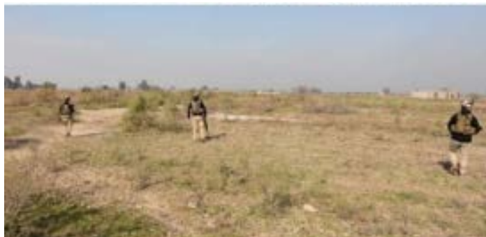
Security activity during Operation Promising Peace, and weapons seized in the operation