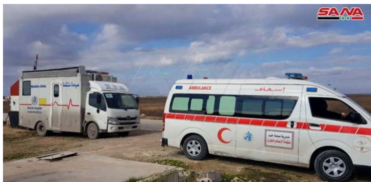
Syrian regime's ambulance and mobile clinic awaiting civilians who wish to leave through one of the humanitarian crossings in the Idlib region