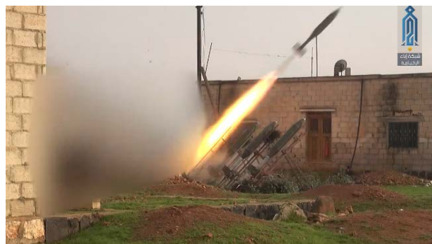
Rockets launched by the Headquarters for the Liberation of Al-Sham against Syrian army positions east of Maarat Nu'man (Ibaa, January 8, 2020)