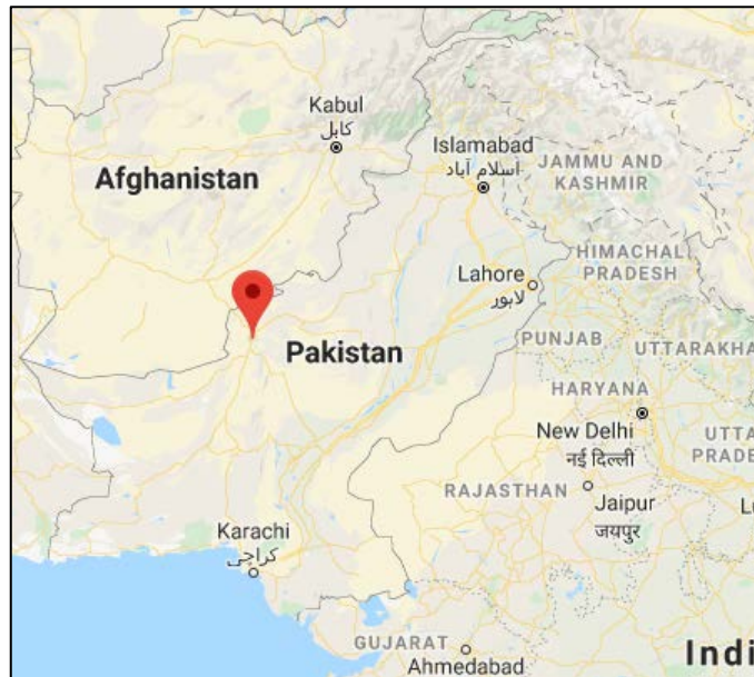
The city of Quetta, in western Pakistan

► ISIS's Pakistan Province claimed responsibility for the attack. According to the claim of responsibility, an ISIS operative codenamed Abu Jarrah al-Baluchi broke into the Taliban headquarters and blew himself up with his explosive vest. According to the claim of responsibility, 19 Taliban operatives and a senior officer in the Pakistani police force were killed, and more than 40 others were wounded. It also stated that in the city of Quetta and its suburbs there is a Taliban command center and many of the headquarters of the organization which operate under the protection of the Pakistani Intelligence and the Pakistani army (January 10, 2020). On the other hand, the Taliban spokesman denied that Afghan Taliban had been in this mosque at the time (The Times of India, January 11, 2020).