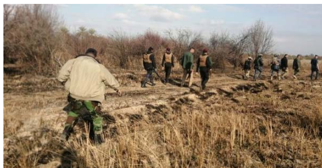
Force from Division 41 of the Popular Mobilization and the Iraqi Federal Police during a security operation (al-hashed.net, January 11, 2020).