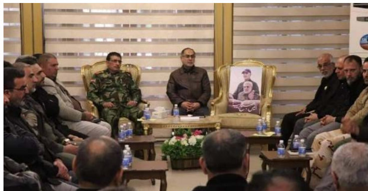
Meeting on security and military priorities held by the Popular Mobilization commanders at the headquarters of the deputy commander of the Popular Mobilization. On the chair in the middle there is a photo of Qassem Soleimani and Abu Mahdi al-Muhandis, who were killed in the US attack on January 3, 2020 (al-hashed.net, January 13, 2020).

► The decision by the Popular Mobilization commanders emphasized the need to intensify the coordination with the Iraqi security forces . Support for the decisions of the Iraqi Parliament and Prime Minister on the removal of foreign forces from Iraq was also expressed (al-hashed.net, January 11, 2020). However, on the ground, the militias operating in the framework of the Popular Mobilization continued their counterterrorism activity against ISIS .