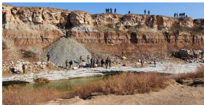
Right: Popular Mobilization fighters near an ISIS workshop which was discovered during their activity. Left: Dust cloud after controlled detonation of explosives and weapons found in the workshop

◆ On January 11, 2020 , Iraqi Federal Police intelligence teams detained two ISIS operatives in Baghdad (Iraqi News Agency, January 11, 2020).