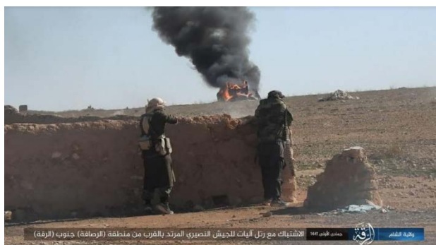
Right: ISIS operatives shooting at a Syrian army convoy. Left: A Syrian army vehicle in flames