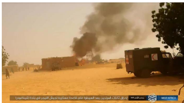
Right: Smoke rising above the Niger army base. Left: ISIS operatives near two Niger army vehicles seized by them during the attack.