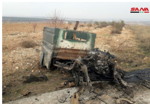
Vehicles destroyed by the Syrian army in Al-Tah, the stronghold of the Headquarters for the Liberation of Al-Sham, south of Maarat Nu'man