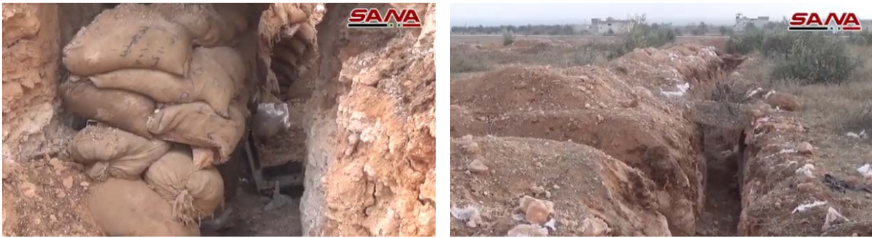
Trench of the rebel organizations in Umm Jalal, southeast of Maarat Nu'man. The Syrian army took control of the village on December 20, 2019 (SANA, December 23, 2019)