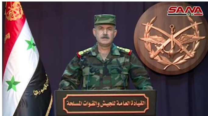
Announcement of the Syrian army's General Staff on the attack in the area of Maarat Nu'man (SANA, December 24, 2019)

► On December 24, 2019, the Syrian army's General Staff announced that over 320 square kilometers had been cleared in the attack and the Syrian army had taken over more than 40 towns and villages in the area south and southeast of Idlib (the area of Maarat Nu'man). The operatives of the Headquarters for the Liberation of Al-Sham and the other terrorist organizations suffered heavy losses and fled the area. Command posts and military equipment of the organizations were destroyed in the attack. The Syrian army's General Staff is determined to finish clearing the Idlib Province from "terrorism." Civilians are called upon to stay away from the areas where the rebel organizations are deployed and arrive in the areas controlled by the Syrian army (SANA, December 24, 2019).