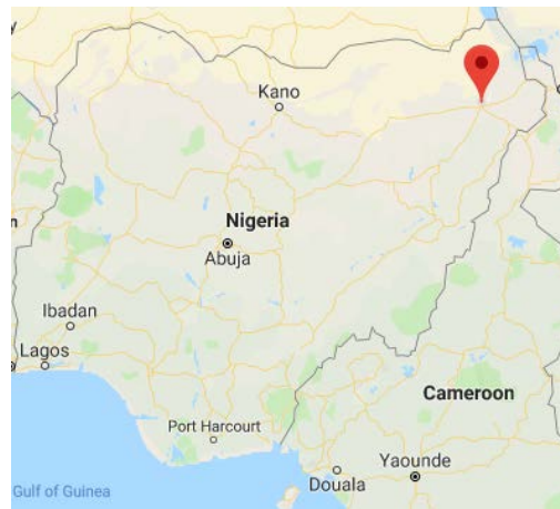
The city of Maiduguri, in northeastern Nigeria (Google Maps)