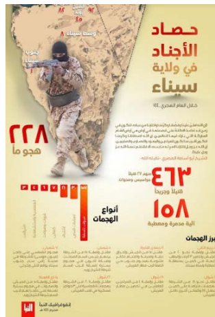
Infographic summarizing ISIS's activity in the Sinai Peninsula in the past year (Al-Naba', as published in Akhbar al-Muslimeen, September 12, 2019)

► On September 12, 2019, ISIS's Al-Naba' weekly published an infographic summarizing the attacks by ISIS's Sinai Province in the period from September 11, 2018 to August 30, 2019. According to the infographic, the Sinai Province carried out 228 attacks, in which 463 people were killed and wounded. A total of 27 people were designated as “agents” and “local militia fighters” (of Bedouin tribes in the Sinai Peninsula who collaborate with the Egyptian government). According to the infographic, the types of attacks carried out are as follows: IED explosions (157); sniper fire (30); exchanges of fire (21); ambushes (7); raids (6); self-sacrifice and suicide bombing attacks (4); and assassinations (3) (Al-Naba', as published in Akhbar al-Muslimeen, September 12, 2019).