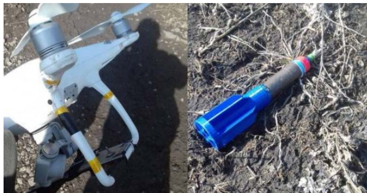
Armed ISIS drone downed by the Popular Mobilization southeast of Baqubah (al-hashed.net, September 11, 2019)

◆ September 11, 2019: A Popular Mobilization force downed an armed ISIS drone about 14 km southeast of Baqubah. The photos released after the incident show a drone with a shell attached to it (al-hashed.net, September 11, 2019).