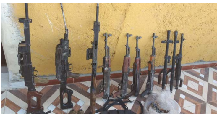
Weapons found in the possession of four ISIS operatives southeast of Al-Mayadeen (SDF Press, September 14, 2019)

► As part of their counterterrorist activity against ISIS networks, the SDF forces captured four ISIS operatives about 30 km southeast of Al-Mayadeen. They also found weapons in their possession (SDF Press, September 14, 2019).