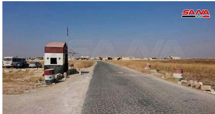
Right: The Abu Zuhur “humanitarian passage” (SANA, September 14, 2019). Left: The areas where the two “humanitarian passages” are located (Google Maps)