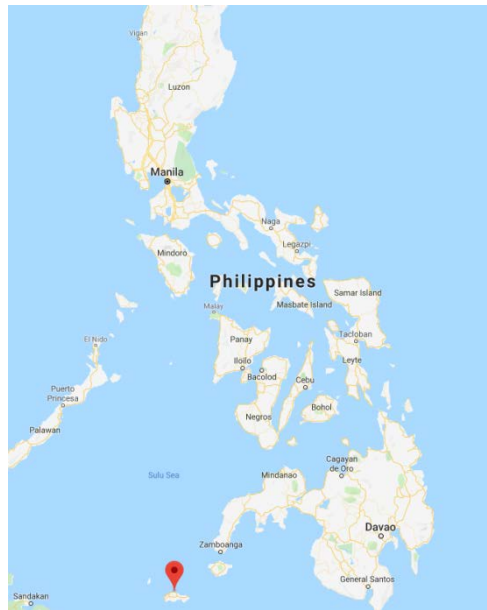
Sulu-Jolo Island in the southern Philippines