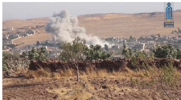
Right: Syrian Air Force attacks around the village of Safuhan, south of Idlib. Left: A building which was destroyed in the airstrikes