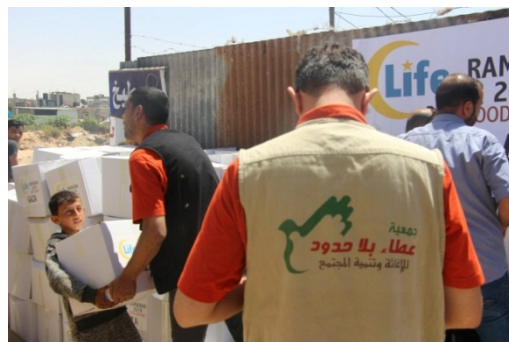
Senior Generosity Association activists stand near packages of food, apparently for distribution during Ramadan. The Life for Relief and Development logo appears on the packages (Generosity Association Facebook page, May 30 2019).