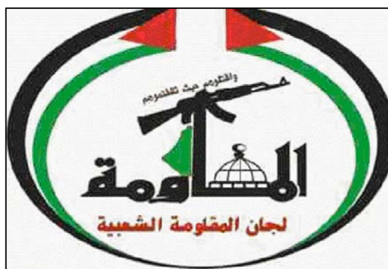
The similarity between the logos of the PRC (right) and Hezbollah (left).