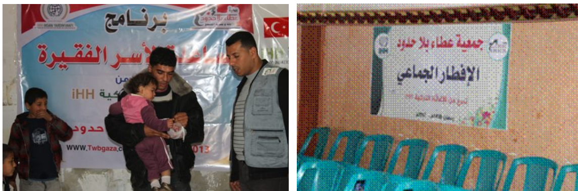
Right: Generosity Association notice about a mass Ramadan fast-breaking meal donated by the IHH (IHH logo in the upper left hand corner) (Generosity Association Facebook page, June 18, 2017). Left: Sign about the distribution of aid to poor families by the Generosity Association, funded by the IHH (Generosity Association Facebook page, February 5, 2013).

Strip. It carries out humanitarian activity in crisis areas. IHH also supports the Hamas administration in the Gaza Strip and its charitable institutions. IHH was outlawed in Israel because of the part it plays in raising funds for Hamas institutions.