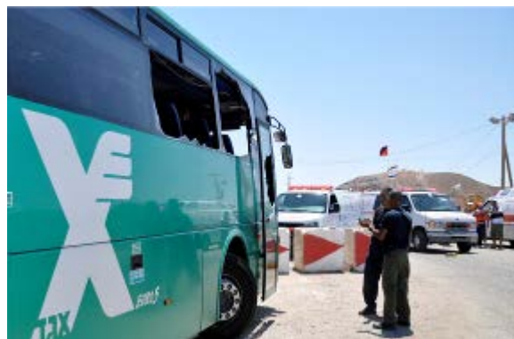
Right: Israeli bus damaged by terrorist fire. The attack injured at least 14 people (Reuters, photo by Lior Grundman, August 18, 2011). Left: Vehicle used by the terrorist operatives (Israeli ministry of defense, photo by Ariel Hermoni, August 19, 2011).