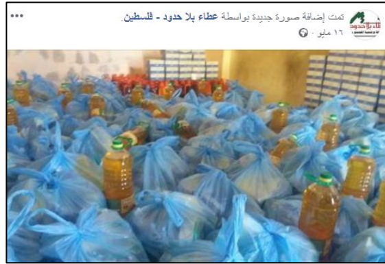
Right: Distribution of food packages as documented on the Generosity Association Facebook page (Generosity Association Facebook page, May 16, 2019). Left: Distribution of food packages as documented on the PRC Facebook page (PRC Facebook page, May 16, 2019). Both pictures are identical.