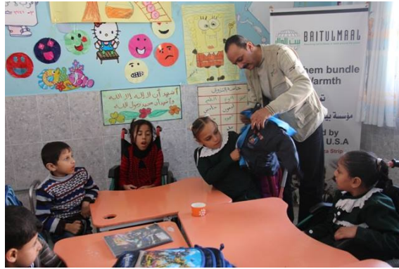
Notice bearing the name of Baitulmaal, United States, part of a Generosity Association operation to distribute winter clothing to needy children in the Gaza Strip (Generosity Association Facebook page, December 5, 2016).