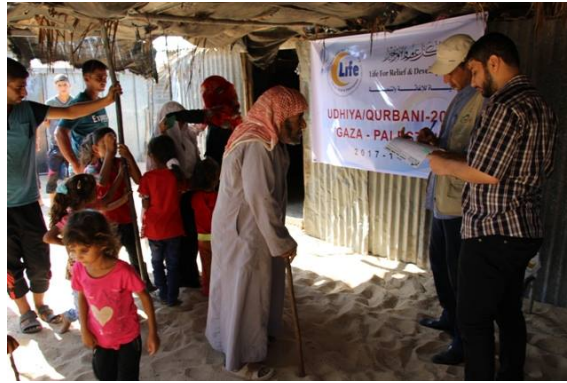
Sign bearing the name and logo of Life for Relief and Development at a Generosity Association project for the distribution of meat for the Eid al-Adha holiday (Generosity Association Facebook page, September 2, 2017).