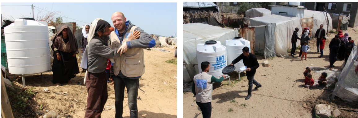
A container of drinking water bearing the UHR logo and activists wearing vests with the same logo. The pictures were taken during a Generosity Association project to bring drinking water to outlying areas in Rafah (Generosity Association Facebook page, March 13, 2019).