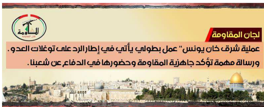
Formal PRC claim of responsibility for an attack on IDF soldiers (Sawt al-Muqawama Facebook page, February 17, 2018).