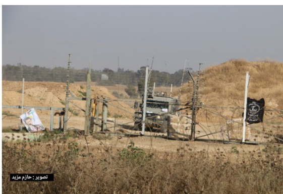
Right: Picture from a video documenting Palestinian rioters crossing the security fence. On the fence are a picture of former Egyptian president Mohamed Morsi and a PRC flag. Left: The Units of the Descendants of al-Nasser send a threat to Israel: "We will turn your nights into day." The picture shows IEDs and Molotov cocktails with fuses in preparation for being attached to balloons and launched into Israel.