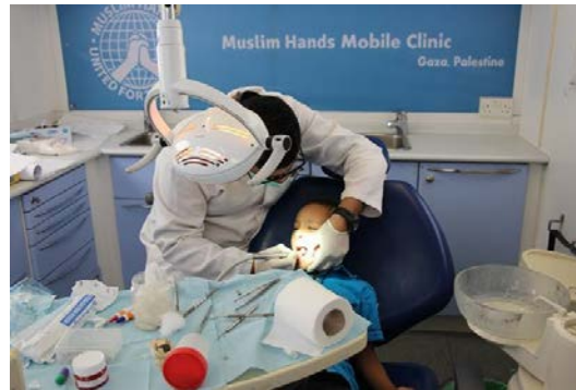
Mobile Muslim Hands dental clinic, brought by the Generosity Association to treat the children of Rafah (Generosity Association Facebook page, July 25, 2016).

► Muslim Hands provides humanitarian aid around the globe. It was founded in 1993 in Nottingham, Britain (organization website).