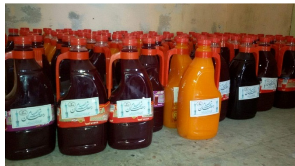
The distribution of packages of dates and bottles of fruit juice. All are marked with the PRC logo (PRC in Rafah Facebook page, May 16, 2019). It can be assumed that the Generosity Association was the source of both the dates and juice.

That is an illustration of how humanitarian aid funds donated to a charitable organization with ties to a terrorist organization support the terrorist organization's military wing.