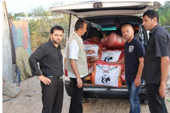
The logo of Muslims In Need on packages containing winter blankets, distributed by the Generosity Association to needy families in the Rafah district (Generosity Association website, October 30, 2016).