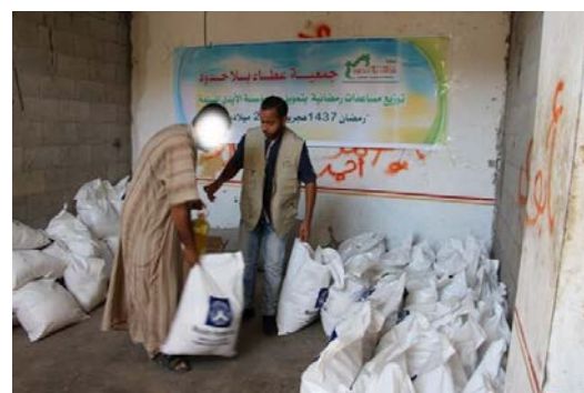
Sign thanking the Generosity Association and Muslim Hands for aid distributed during Ramadan (Generosity Association Facebook page, June 22, 2016), along with sacks of food bearing the organization's name (Generosity Association Facebook page, June 19, 2016).