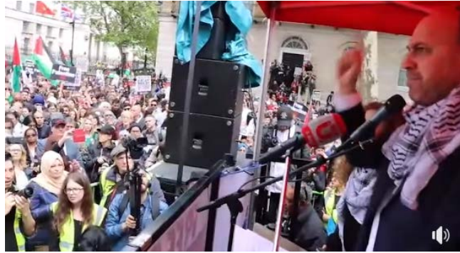
Husam Zomlot, PA representative in Britain, gives a speech at the Nakba Day rally in central London (Husam Zomlot's Facebook page, May 12 and 14, 2019).