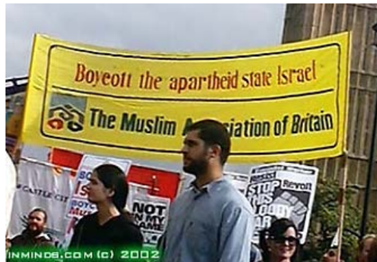
Sign held by MAB activists at a rally in London on September 28, 2001.

► For many years the MAB was the most active Muslim Brotherhood organization in Britain. It collaborated with radical British leftist groups, especially members of the young Muslim Brotherhood generation.