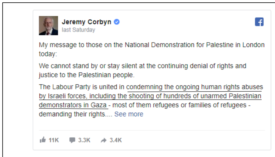
Jeremy Corbyn uses his Facebook page to encourage Nakba Day participants (Times of Israel, May 11, 2019) (ITIC emphasis).

► At the Nakba Day events in London members of the Labour Party participated. The demonstration was supported by anti-Israeli Labor Party leader Jeremy Corbyn, who posted a message in support of Nakba Day demonstrators on his Facebook page. The post condemned "the ongoing human rights abuses by Israeli forces, including the shooting of hundreds of unarmed Palestinian demonstrators in Gaza" (a biased and distorted description the situation in the Gaza Strip, where IDF soldiers use extreme caution in dealing with rioters who throw IEDs at them, attempt to cross into Israeli territory and repeatedly carry out provocative acts towards the State of Israel). In addition, the Palestinian Forum in Britain posted a picture showing Jeremy Corbyn holding a sign used by participants in the Nakba Day events. It showed a key, the Palestinian symbol of the "right of return" which means the destruction of the State of Israel. 1