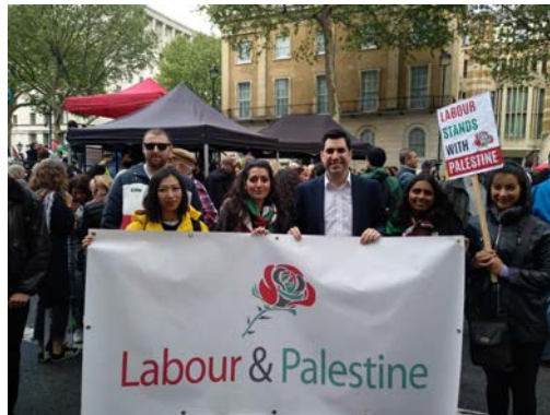
British Labour Party Richard Burgon at the Nakba Day demonstration, holding a sign showing the Labour Party's support for Palestine (Richard Burgon's Facebook page, May 11, 2019). He said "Palestine has the right to exist but sadly that is a right that is increasingly threatened ... Palestinians should be able to live free from ever expanding settlements on stolen land" (Guardian, May 10, 2019).