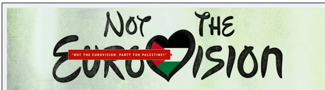
The PSC website homepage called for a boycott of the Eurovision song contest.

► Palestine Solidarity Campaign (PSC) is an anti-Israeli organization established in Britain in 1982. It leads the campaign in Britain to boycott Israel and is also active in disseminating anti-Israeli propaganda. The organization holds protests against companies that import merchandise from Israel and against stores that sell Israeli products. It has a number of offices in London, as well as in Scotland and Wales. Its members are British non-Muslims, Muslims and Palestinians living in Britain. Some of its activists participated in the Mavi Marmara flotilla. Most of its activity is carried out by volunteers (the organization claims several thousand). It is headed by an executive committee of 20 members, plus two members representing the PSC's Trade Union Advisory Committee, who are elected at the Annual General Meeting by its members.