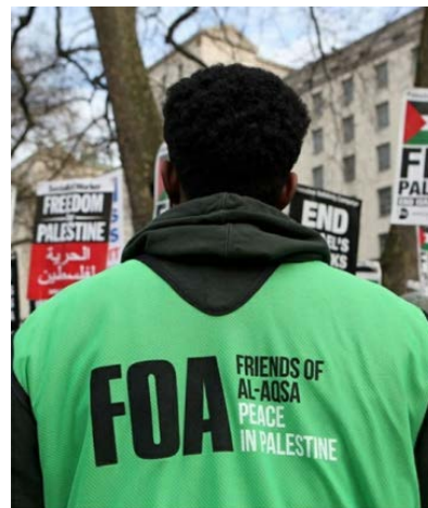
Right: Call to participate in FOA activities. Left: Call to boycott Israeli dates