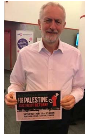
Right: The British Labour Party leader holds a sign used in the Nakba Day events. It shows a key, the symbol of the so-called "right of return" of the Palestinians (Palestinian Forum in Britain Facebook page, May 11, 2019). Left: Sign used by the participants in the Nakba Day events (Palestine Solidarity Campaign, May 2019).