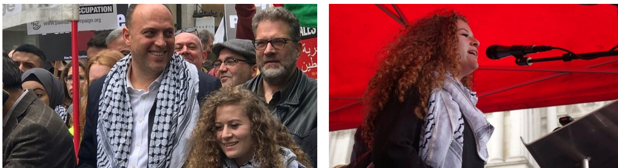
Right: Ahed Tamimi gives a speech at the rally. Left: Ahed Tamimi walks next to Husam Zomlot, PA representative in Britain, at the anti-Israeli rally in central London.