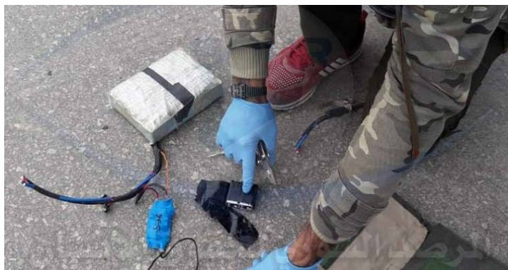
Suicide bombing attack in Al-Raqqah thwarted: neutralizing the explosive belt (Syrian Observatory for Human Rights, March 5, 2019)

► Local Al-Raqqah sources reported that on March 5, 2019, a suicide bombing attempt by an ISIS operative in the Al-Raqqah rural area had been thwarted. The SDF forces detained the operative while he was riding his motorcycle, wearing an explosive belt and carrying a machine gun (Syrian Observatory for Human Rights, March 5, 2019).