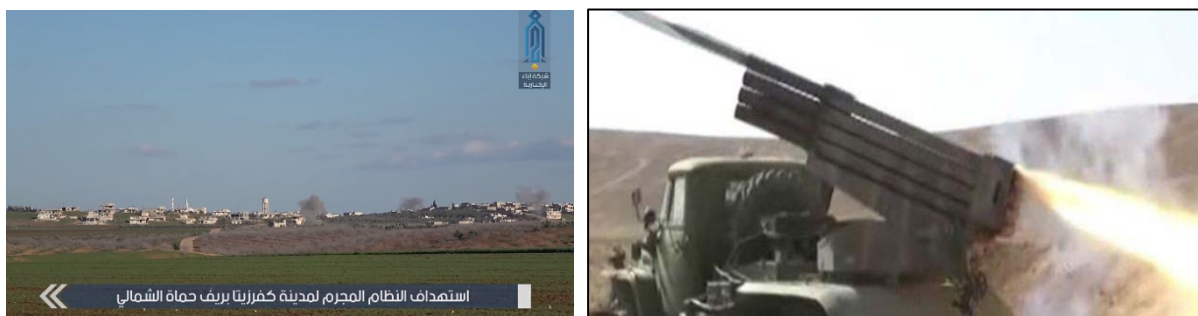
Right: Syrian army fire in the south of an enclave in Idlib. Left: Syrian army artillery fire hits in the village of Zeita.

► This week as well, incidents continued between the Syrian army and the jihadi organizations in the Idlib area. Syrian army forces fired artillery at the rebel targets in the Idlib area. The forces fired at the Al-Ghab Plain, south of Aleppo, and the rural area of Idlib (the Syrian Observatory for Human Rights, March 4, 2019; SANA, March 4, 2019). According to a report by the Headquarters for the Liberation of Al-Sham, the Syrian army fired artillery at the village of Zeita, north of Hama. On March 5, 2019, the Syrian army fired at targets of the Headquarters for the Liberation of Al-Sham near the city of Khan Shaykhun (SANA, March 5, 2019).