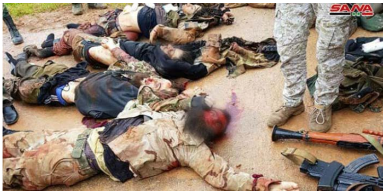
Bodies of “terrorist operatives” killed attacking Syrian army positions north of Hama (SANA, March 3, 2019)

the southern part of the enclave (Butulat Al-Jaysh Al-Suri, March 3, 2019; SANA, March 3, 2019).