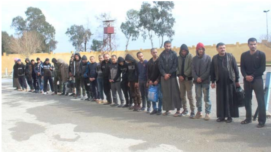
Twenty-four people suspected of belonging to ISIS who were released by the SDF forces (SDF Press, March 4, 2019)

► The SDF forces released 24 people from the Al-Raqqah area. These people, who are suspected of being ISIS operatives but with no Syrian blood on their hands, were allowed to join their relatives (SDF Press, March 4, 2019).