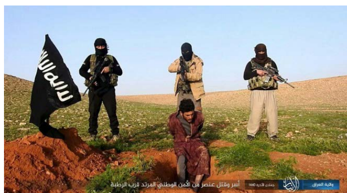
Execution of an Iraqi National Security Agency operative taken prisoner by ISIS (Shabakat Shumukh, March 1, 2019).

◆ Al-Anbar Province: An operative of the Iraqi National Security Agency was taken prisoner by ISIS operatives. He was executed near Rutba, in the western part of the Al-Anbar Province (Shabakat Shumukh, March 1, 2019).