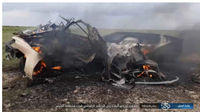
Popular Mobilization vehicle destroyed in an ISIS ambush (Shabakat Shumukh, March 1, 2019)