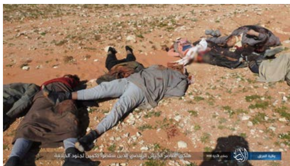
Popular Mobilization operatives killed in an attack by ISIS on the Arar border crossing between Iraq and Saudi Arabia, and documentation seized by ISIS (Shabakat Shumukh, March 2, 2019)