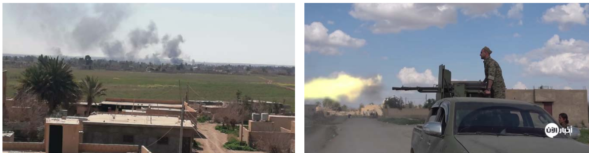
Right: SDF force in the village of Al-Baghrouz Fawqani (Al-Aan channel, March 5, 2019). Left: Smoke rising from the fighting zone in Al-Baghrouz Fawqani (ANHA, March 3, 2019)

2019). The SDF spokesman admitted that the Kurdish forces were forced to slow down their attack in Al-Baghrouz due to ISIS's use of civilians as human shields. According to the spokesman, the takeover of ISIS's last stronghold "will soon be completed" (Mostafa Bali's Twitter account, March 3, 2019).