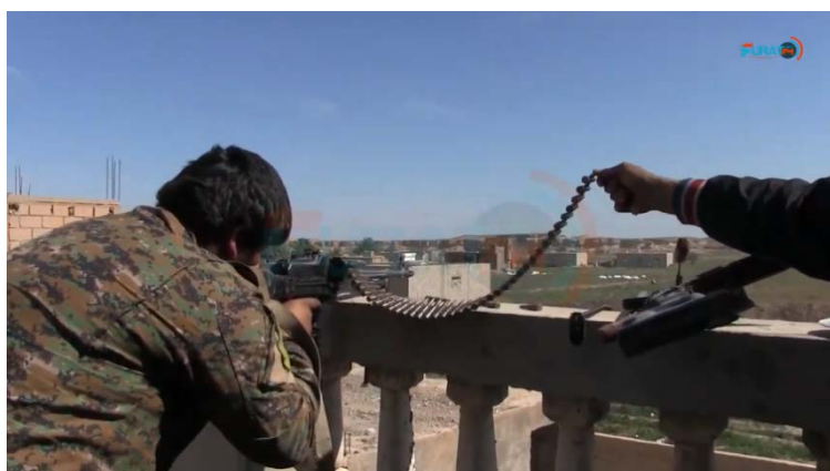
SDF fighter during the fighting in Al-Baghrouz Fawqani

► On March 3, 2019, there was a lull in the fighting for several hours, during which about 3,000 people, mostly civilians, were evacuated from the village. About 300 ISIS operatives who were part of this group surrendered to the SDF forces. About 1,000 ISIS operatives reportedly remain in the "pocket" in Al-Baghrouz and civilians are still trapped in the village (Reuters; Furat Post; Mostafa Bali's Twitter account, March 4, 2019). It was reported that the SDF had carried out a "showcase operation" and managed to liberate five of their men who had been held prisoner by ISIS (ANHA, March 5, 2019).