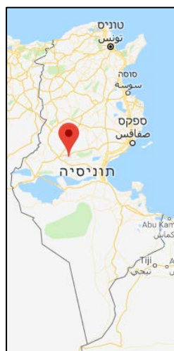
Mount Arbata, in central Tunisia

► ISIS announced that its operatives had planted mines against Tunisian army soldiers on Mount Arbata, in central Tunisia. According to the announcement, one soldier was wounded (Shabakat Shumukh, March 2, 2019). A spokesman for the Tunisian Ministry of Defense announced that a Tunisian army soldier had been killed (Shems FM, Tunisian radio station and news website, March 1, 2019).