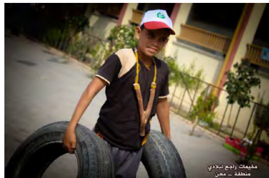
Collecting tires and hiding behind piles of tires to use slingshots in the Ma'an region / the Abu Obeida branch in Khan Yunis.