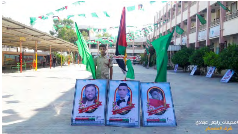
Glorifying shaheeds killed during the "return marches." Pictures of shaheeds from the Jabalia refugee camp in the summer camp held in a Hamas school in the eastern part of the Jabalia refugee camp (Facebook page of the summer camps committee in the northern Gaza Strip, July 16, 2018).