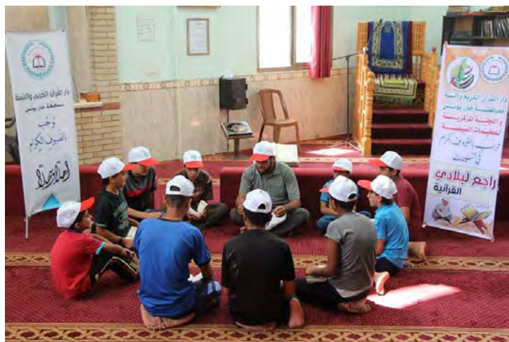
Qur'an memorization at a summer camp in the Khan Yunis refugee camp in cooperation with the Dar al-Qur'an wal-Sunna association (Facebook page of the summer camps committee in Khan Yunis, July 16, 2018).