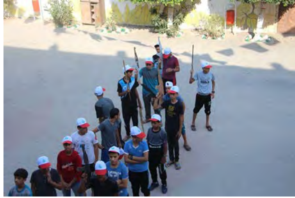
Weapons training in a Hamas summer camp in the al-Amal neighborhood of the Khan Yunis refugee camp (Facebook page of the summer camps committee in Khan Yunis, July 17, 2018).