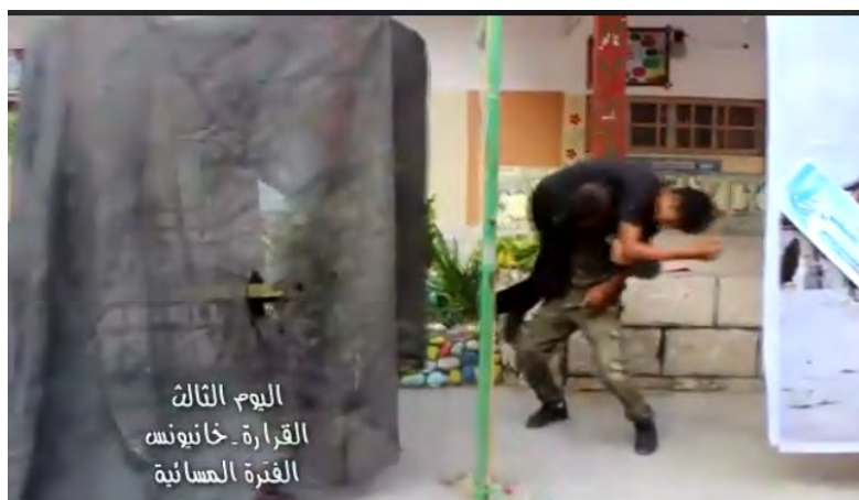
Simulating the abduction of an IDF soldier from a post (Facebook page of the summer camps committee in Khan Yunis, July 17, 2018).