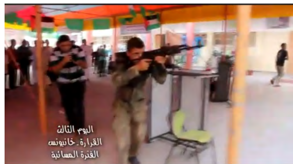
Beginning to move towards storming an "IDF post" (Facebook page of the summer camps committee in Khan Yunis, July 17, 2018).