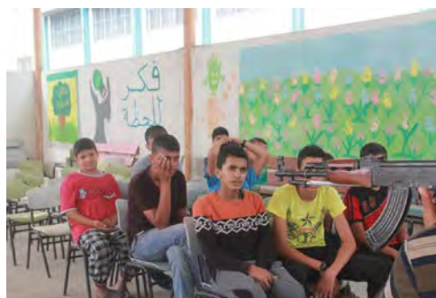
Right: A lesson in a Ma'an summer camp (a neighborhood in southwestern Khan Yunis). Left: A lesson in disassembling and reassembling a rifle. The lesson took place in one of the classrooms in a local school (Facebook page of the summer camps committee in the Ma'an area, July 14 and 15, 2018).