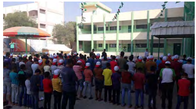
Mass prayers held in the summer camp in the town of Khirbat Ikhza'a, east of Khan Yunis.