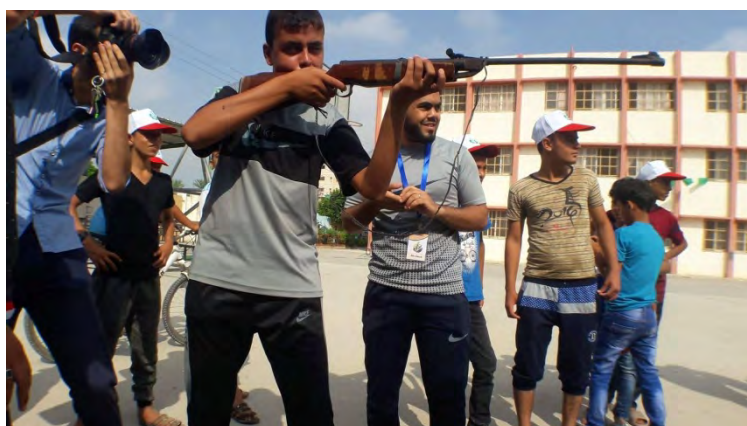
Weapons training in the summer camp in the Qarara neighborhood of eastern Khan Yunis (Facebook page of the summer camps committee in Khan Yunis, July 15, 2018).