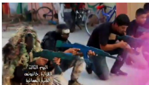
Right: Weapons training. Left: Display of firing positions and camouflage during a visit of a Hamas delegation to a camp in Khan Yunis.