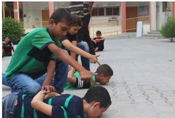
Training in overpowering and abducting Israeli civilians (Facebook page of the summer camps committee in the Ma'an region, July 14 and 15, 2018).