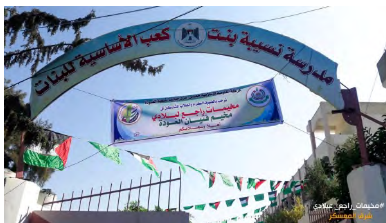
Hamas notice announcing the opening of the summer camps in the eastern part of the Jabalia refugee camp in one of the governmental schools (the Nuseiba Bint Ka'ab girls' elementary school) (Facebook page of the summer camps committee in the northern Gaza Strip, July 15, 2018).