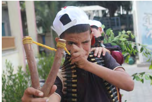
Practicing using slings and slingshots to hurl stones in the Ma'an region / the Abu Obeida branch in Khan Yunis.