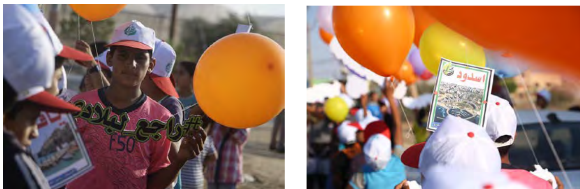
Youths launch balloons at the opening ceremony. Slips of paper are attached to the balloons with the names of the camps and of the cities and villages the Palestinians fled from in 1948. Right: A balloon with "Isdud" (the southern Israeli city of Ashdod). Left: A balloon with Jaffa (Facebook page of the summer camps committee in Khan Yunis, July 14, 2018).