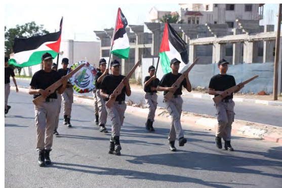
Right: Gazan youths march with wooden rifles at the opening ceremony of the summer camps (Facebook page of the summer camps committee in Khan Yunis, July 14, 2018). Left: Weapons training in the summer camp in the al-Qarara neighborhood in the eastern part of Khan Yunis (Facebook page of the summer camps committee in Khan Yunis, July 15, 2018).

► Summer camps are held every year throughout the Gaza Strip, attended by tens of thousands of children and adolescents. Most of the camps are organized by Hamas. Some of them are held by other terrorist organizations and various institutions (in the past UNRWA was active in organizing summer camps, but stopped because of budget constraints). Campers enjoy a wide range of activities. Every year a considerable amount of time is devoted to military training and Hamas ideology indoctrination. Hamas considers the camps as important tools for exerting its influence over the younger generation and