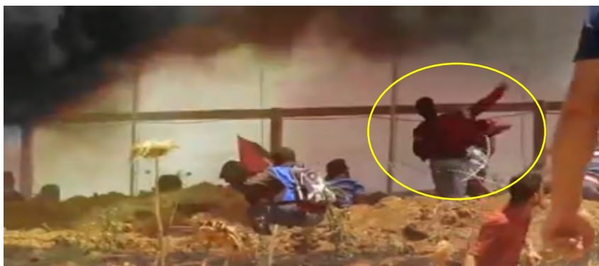
Saadi Abu Salah throws stones at IDF forces near the border fence in the northern Gaza Strip