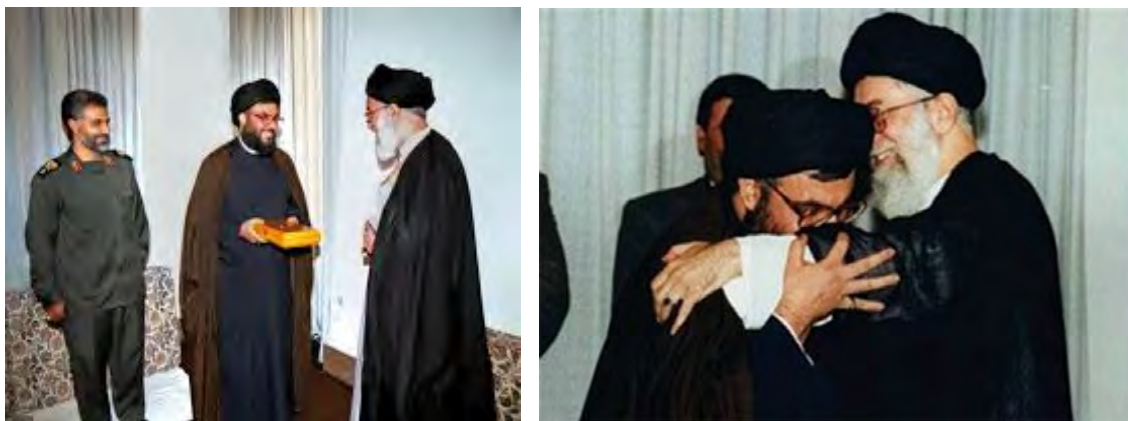
On the right: Iran's Supreme Leader Khamenei and Hezbollah Secretary General, Nasrallah (Tasnim: November 12, 2014). On the left: The Supreme Leader Khamenei, Hezbollah Secretary General, Nasrallah, and the Commander of the IRGC's Qods Force, Qasem Soleimani (the website of the Supreme Leader, August 11, 2016)