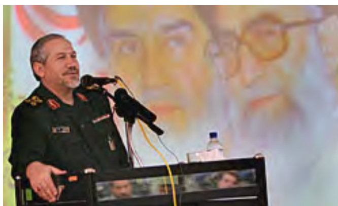
Sayed Yahya Rahim Safavi during a speech in which he labeled Nasrallah as "a soldier" of Khamenei. In the background are photos of Khomeini and Khamenei

► On June 2, 2012, Sayed Yahya Rahim Safavi, former Revolutionary Guards commander and Ali Khamenei's current Military Affairs Adviser, was interviewed by the Iranian channel Press TV. One of the topics under discussion was Hezbollah's involvement in a possible Iraninian-Israeli confrontation. Safavi stated that Hezbollah had thousands of rockets, and if Israel wanted to attack Iran, it was extremely likely that Hezbollah would use those rockets to attack Israel. He added that he regarded Hezbollah leader Hassan Nasrallah as "a soldier of the Leader" Khamenei. He added that Iran also had the ability to attack Israel with its long-range rockets: "There is no place within the Zionist entity that is out of range of our rockets" (Press TV, June 2, 2012). Safavi made a similar statement in 2008, asserting that "...Sayed Hassan Nasrallah regards himself as a soldier of the Iranian Leader and the men of Hezbollah take their example from the brave men and women of Iran".