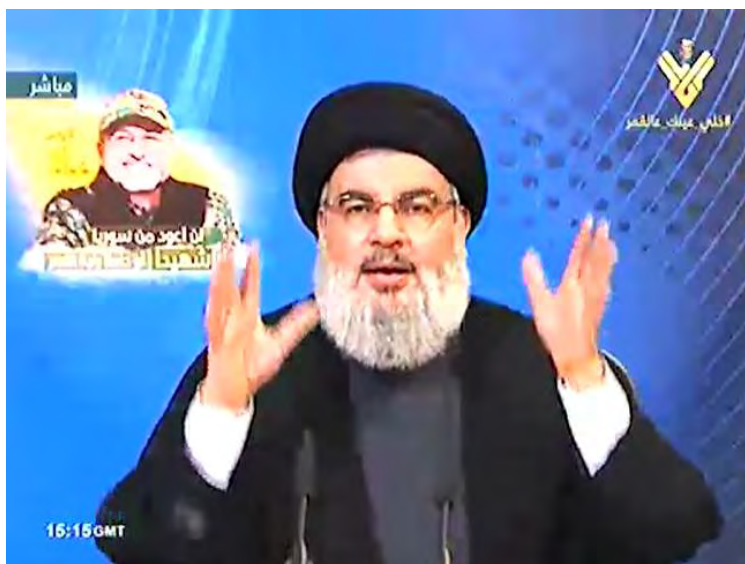
Hezbollah secretary general, Hassan Nasrallah, delivers a speech, June 24, 2016 (Al-Ahed, June 24, 2016)

Leader of Iran Khamenei for his support for Hezbollah throughout all the years of the organization's existence and until today. 3