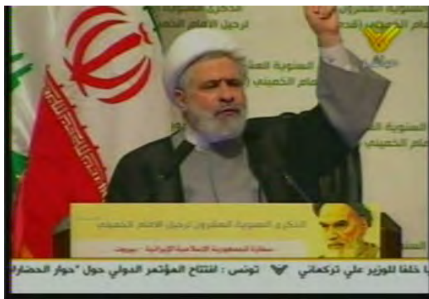
Sheikh Naim Qassem, Deputy Secretary General of Hezbollah, during a speech at a ceremony organized by the Iranian embassy in Beirut on the anniversary of the passing of Khomeini