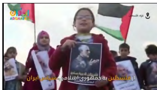
Palestinian children in the Gaza Strip thank Qassem Soleimani and Iran (al-Alam TV, December 27, 2017).