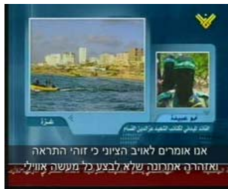
The Izzedine al-Qassam Brigades spokesman announces the abductors' demands and warns the Zionists "not to do anything stupid" (Al-Manar TV, June 26).

✦ Hamas, the Popular Resistance Committees (PRC) and the Army of Islam issued a joint announcement demanding Israel release all the female and minor Palestinian security prisoners currently held in Israeli jails. In return, Israel would receive information about the abducted soldier (Izzedine al-Qassam Brigades Website, June 26). [Note: According to Haaretz, June 27, there are 313 underage prisoners in Israeli prisons, of whom 91 have blood on their hands, and 109 women, of whom 64 have blood on their hands. They are all terrorists who were involved in suicide bombing attacks and murders.)