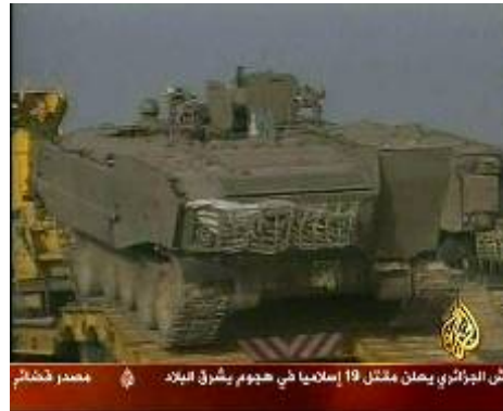
IDF forces concentrated at the edge of the Gaza Strip (Al-Jazeera TV, June 26).