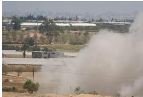
Blowing up the tunnel

✦ On the morning of June 26, IDF forces blew up the tunnel used by the group of Palestinian terrorists to infiltrate into Israeli territory. The tunnel shaft was exposed in a Palestinian house 350 meters (about 380 yards) from the fence separating the Gaza Strip from Israel.