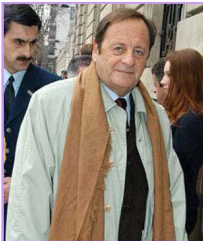
Судья Родольфо Каникоба Корраль