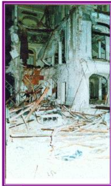
Разрушения в результате теракта