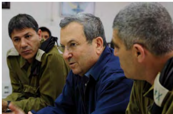
Defense Minister Ehud Barak visits troops in Israel's south (IDF Spokesman, March 13, 2012).

17. In reference to the current escalation the Israeli Defense Minister, Ehud Barak , said during a visit to troops in the south that the current round of escalation again proved that the IDF would strike anyone who tried to act against Israel. He said that the Israeli Southern Command, in coordination with the IAF, the Israel Security Agency and military intelligence were acting correctly and decisively to deal with the rocket threat (IDF Spokesman, March 13, 2012).