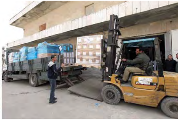
Trucks loaded at the PA health ministry in Ramallah with medicines and medical equipment for the Gaza Strip (Wafa News Agency, March 11, 2012).