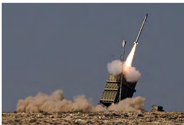
The Iron Dome aerial defense system which has intercepted dozens of rockets fired from the Gaza Strip during the current round of escalation