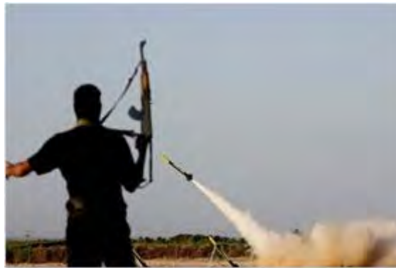
Rocket fire from the Gaza Strip targeting Israeli territory ( Hamas' Palestine-info website, March 13, 2012).

7. Many organizations continue to claim responsibility for the rocket fire. However, most of the rockets were apparently launched by the Palestinian Islamic Jihad . In claiming responsibility the organizations chiefly reported firing Grad and 107mm rockets (Terrorist organization websites, March 12, 2012).