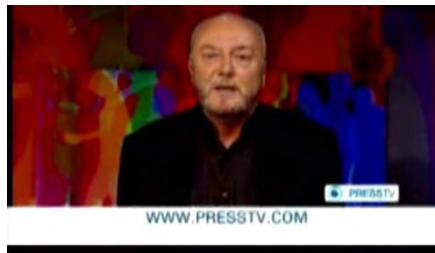
George Galloway in the Press TV video, part of the propaganda campaign for the marches (YouTube)

7) The Iranian English-language Press TV channel was also enlisted to promote a propaganda campaign for the marches. On January 8, 2012, a video was posted on YouTube to promote the marches, produced by Press TV and featuring George Galloway , who gave his blessing to the marches, which, he said, would promote the return of the Palestinians to what [the Israelis] called Israel. Press TV also broadcast a conference call between George Galloway and a pro-Palestinian anti-Israeli Indian activist named Feroze Mithiborwala, an organizer of the Asian convoy and of the GMJ (YouTube). In addition, a Facebook page was opened in Farsi for the GMJ (Facebook.com/Farsi).