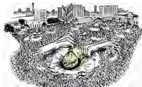
Announcement of the cartoon contest in support of the GMJ issued by the Fars News Agency, Tehran, Iran

TEHRAN (FNA)- Iran's Cartoon House plans to hold a cartoon contest in support of the Global March to Jerusalem, a movement for the freedom of the Holy Quds.