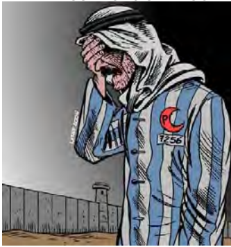
A Palestinian wearing the striped suit of an Auschwitz concentration camp inmate, submitted by Carlos Latif, a Brazilian who runs an anti-Semitic blog.

convention was held in Tehran, announced a contest for anti-Semitic, Holocaust