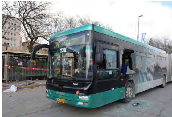
Terrorist attack at a bus station near the International Convention Center in Jerusalem on March 23, 2011. A British citizen was killed and 47 Israeli citizens were wounded in the attack (photo by National Press Bureau, March 24, 2011).

9. Beginning in mid-August 2010, the ISA, with the assistance of the IDF and the Israeli police, exposed a Hamas military network based in Hebron that was planning to carry out mass murder terrorist attacks and kidnap Israeli citizens. The Hebron network also had a branch in Jerusalem, which on March 23, 2011 set an IED near the International Convention Center in Jerusalem. 2