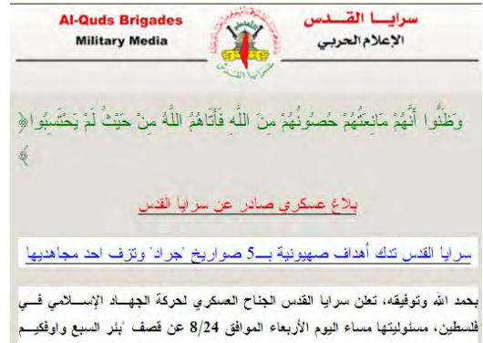
Claiming responsibility for the Grad rockets fired at Beersheba, Ofakim, Ashqelon and the population centers neat the Gaza Strip on the night of August 24.