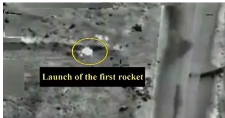
Left: Launch of the first rocket into Israel (IDF Spokesman's Website, August 25, 2011). Right: PIJ terrorist operative killed by the IDF, Atiya Mahmoud Muqat (Photo: website of the Jerusalem Battalions, the PIJ's military wing, August 25, 2011).