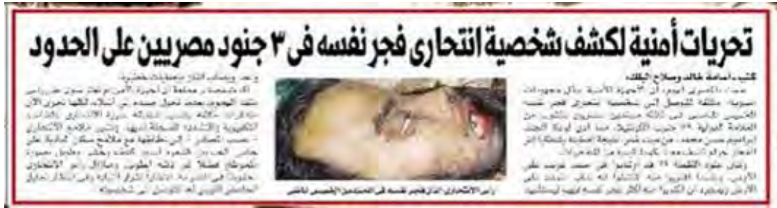
Picture of the suicide bomber