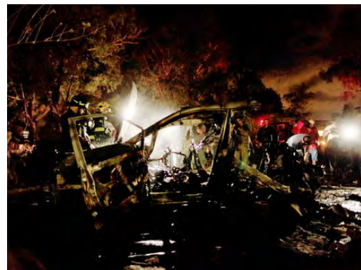
Left: Baby who sustained minor injuries from a rocket hit in Ashqelon. Right: Car hit directly by a rocket.

5. A number of terrorist organizations operating in the Gaza Strip claimed responsibility for the rocket fire, especially the Palestinian Islamic Jihad . According to the organization's website, the PIJ was responsible for Grad rocket fire targeting Beersheba, Ashqelon, Ofakim and other western Negev population centers on the night of August 24. According to the Egyptian media, one of the rockets fired from the Gaza Strip fell in Nafura Square in Egyptian Rafah, wounding a woman.