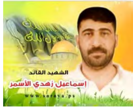
Ismail Zahdi al-Asmar, a Jerusalem Battalions commander, killed in an Israeli Air Force attack (Photo from the Jerusalem Battalions website, August 25, 2011).