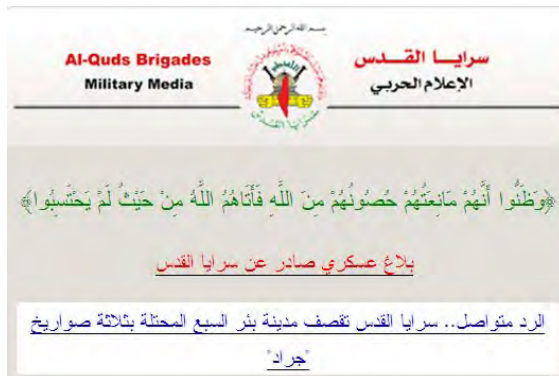
Claiming responsibility for the Grad rocket fired on at 2315 hours on August 24.