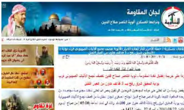
The PRC claims responsibility for firing mortar shells at an IDF vehicle east of Rafah (0500 hours, August 22)

1) Rocket and mortar shell fire on the morning of August 22: Between 0400 and 0800 hours 11 rockets and a number of mortar shells were fired into the western Negev (including the region of the city of Ashqelon). Responsibility for two of the attacks (rocket fire and three mortar shells) was claimed by the PRC.