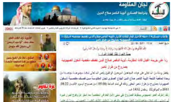
The PRC claims responsibility for firing a rocket (Nasser-3) at the western Negev (0600 hours, August 22) (Qaweim.com website).

2) Quiet during the day, August 22: Between 0800 and 1930 hours the ceasefire was honored. During the afternoon, as noted, the main PRC faction (the Al-Nasser Salah al-Din Brigades) declared it would join the lull in the fighting, and during the afternoon Hamas formally announced that the various organizations operating in the Gaza Strip had committed themselves to honoring the lull.