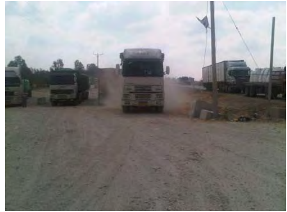
Trucks carrying merchandize enter the Gaza Strip during the recent escalation (Israeli government coordinator for the territories, August 23, 2011).

7. In addition, more than 100 Palestinians from the Gaza Strip in need of medical treatment entered Israel and dozens of foreign volunteers were permitted to enter the Gaza Strip (Websites of the Israeli government coordinator for the territories and the IDF Spokesman, August 23, 2011).