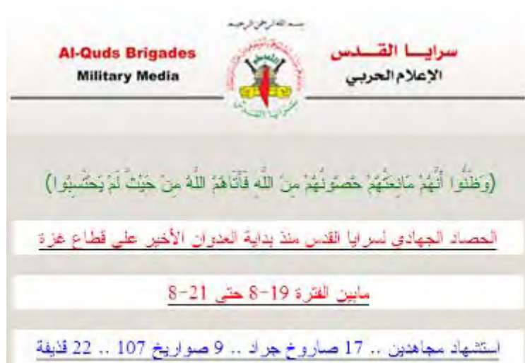
The PIJ claims responsibility for rocket fire into Israeli territory between August 19 and 21

5. The Palestinian Islamic Jihad issued a statement detailing the rocket attacks in which the organization was involved between August 19 and 21. According to the announcement, the organization fired 17 standard Grad rockets, nine 107mm rockets, three Quds rockets [of local manufacture], and 22 mortar shells (PIJ's Jerusalem Battalions website, August 23, 2011). The main faction of the PRC (the Salah al-Din Brigades) reported that its operatives had fired dozens of rockets into southern Israel during the last round of attacks . Thus it can be seen that both organizations played a major role in rocket attacks against Israel in the latest round of escalation (160 rockets were fired at Israel, 120 of them landing in Israeli territory).