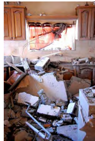
A house in Ofakim, hit by a rocket and totally destroyed, August 20.