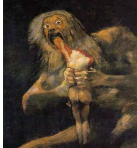
Francisco José de Goya's original painting of "Saturn Devouring His Children", painted in 1819-23 and located in the Prado in Madrid. The painting inspired the anti-Israel and anti-Semitic poster seen at the demonstration.