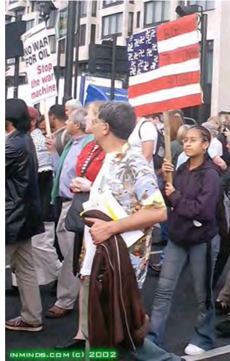
The United States flag with stars replaced by swastikas and dollar signs (inminds.com, 2002). Demonstrators also carried a poster saying "Bush 21st century Hitler" (inminds.com, 2002).