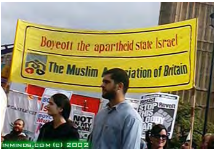
“Boycott the apartheid state Israel” reads the Muslim Association of Britain banner. A poster to boycott Israel at a demonstration in London on September 28, 2002. The poster is held by the MAB, an organization taking part in the delegitimization campaign affiliated with the Muslim Brotherhood.