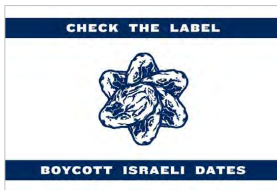
The poster of the campaign to boycott Israeli dates