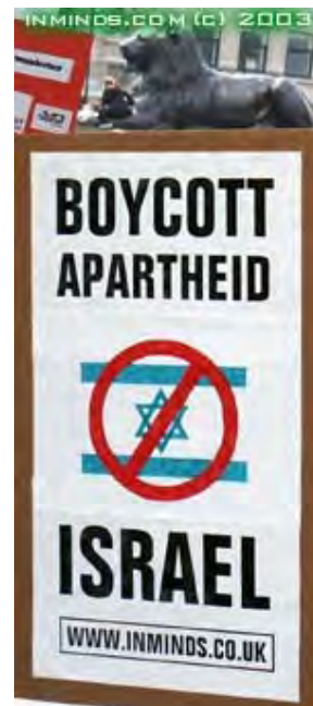
Poster at an anti-Israel demonstration in London (May 2003)