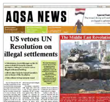
Freely-distributed quarterly publication produced by the FOA

b. Leaflets —as part of the campaign to raise awareness of the situation in Palestine and the Al-Aqsa Mosque, the organization published a series of leaflets, each focusing on a different aspect.