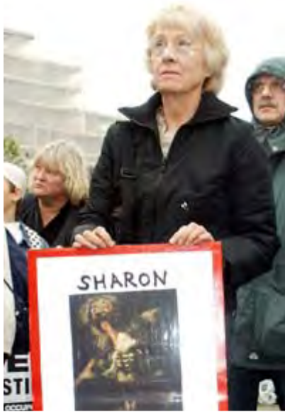
Demonizing Israel and its prime minister: "Sharon Devouring Palestine". The poster reflects a well-known anti-Israel and anti-Semitic theme of portraying Israel (and Jews) as bloodthirsty killers.