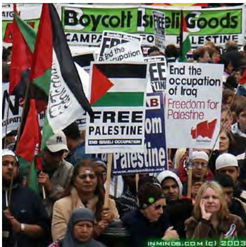
"Boycott Israeli Goods – Free Palestine"