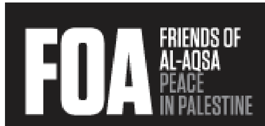
The Friends of Al-Aqsa logo

1. Friends of Al-Aqsa (FOA) is an anti-Israeli NGO established in Britain in 1997. The organization is based in the city of Leicester (home to a large Muslim population) and has branches in London and other British cities. Self-described as anti-Zionist , the FOA qualifies Israel's policy as "apartheid", supports Hamas and the "resistance" (i.e., terrorism), and seeks to put an end to Israel's existence as the state of the Jewish people under the title of "liberation of Palestine". Similarly to other organizations taking part in the delegitimization effort, the FOA attempts to conceal and play down its real objectives by fine-tuning its rhetoric for Western ears and using such terms as "peace in Palestine", "respect for international law", "respect for human rights", and "implementation of UN resolutions".