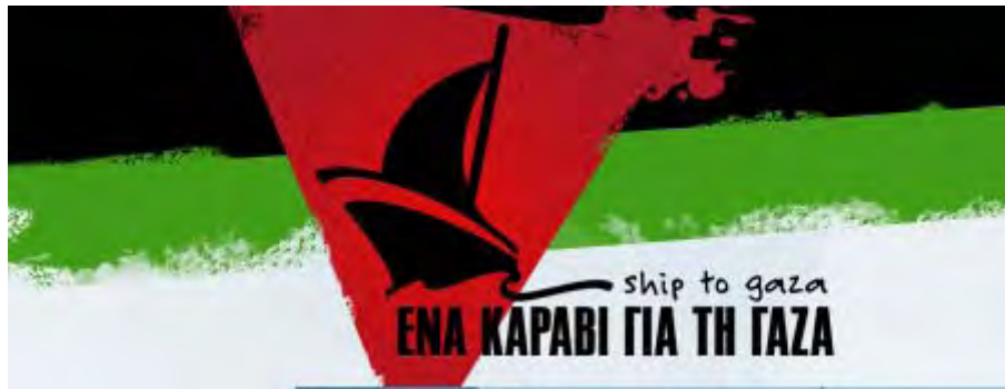
Ship to Gaza Greece

42. Ship to Gaza Greece is a Greek network participating in the flotilla "to break the siege." Its activists are in the process of purchasing a ship, as they did for the previous flotilla. On October 2, 2010, a conference was held in Athens with representatives from Athens and other Greek cities, as well as Palestinians. A report was given about a coordination meeting held with the organizers of Freedom Flotilla 2 in Athens, September 26-27, 2010. In our assessment, the Greek network plays an important role in organizing the flotilla. One of the organizations participating in the Mavi Marmara flotilla was a Greek network called The Greek Ship to Gaza Campaign.