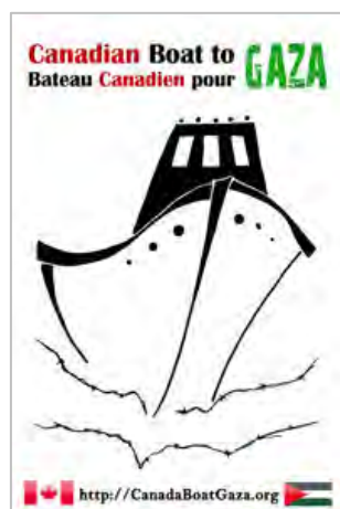
Canada Boat to Gaza

61. Three Canadians participated in the previous flotilla to the Gaza Strip, two of them aboard the Mavi Marmara . This time the anti-Israeli organizations and activists in Canada seek to enlarge the Canadians delegation.