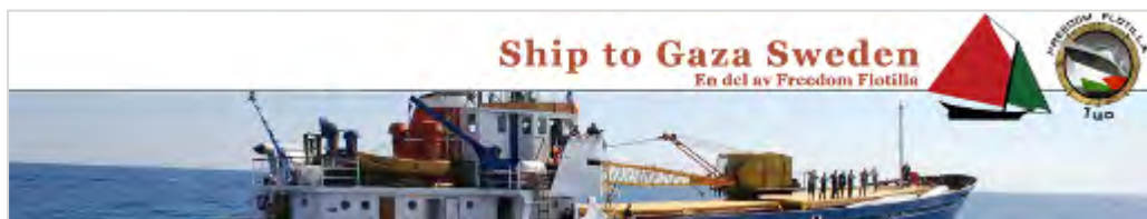
Ship to Gaza Sweden

49. Ship to Gaza Sweden seeks to purchase and equip a humanitarian assistance ship to send to the Gaza Strip. According to the organizers, the assistance will be transferred to the Gaza Strip for independent apolitical organizations. Ship to Gaza Sweden has appealed for volunteers to join and/or to raise contributions by buying "sea miles" or concrete. The network issued a book and CD about the events which took place aboard the Mavi Marmara and sells them on its website.