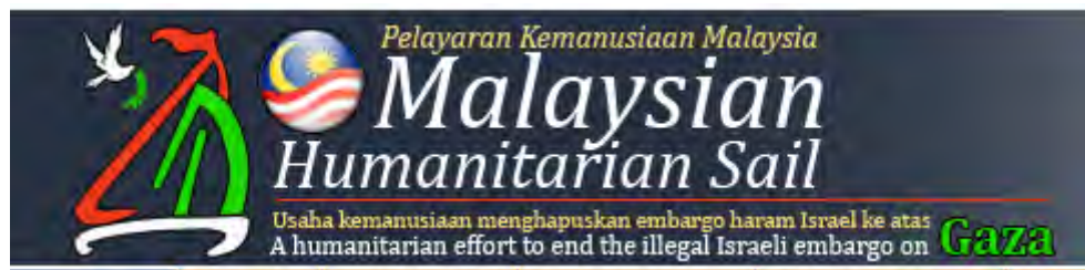
Malaysian Humanitarian Sail

70. The Malaysian Humanitarian Sail is a network composed of several NGOs collaborating to participate in the flotilla. It is supported by local, Palestinian and Muslim organizations. It operates through the FGM, the Turkish IHH, the Indonesian MERC and KISPA, and a number of other NGOs in various parts of the world.