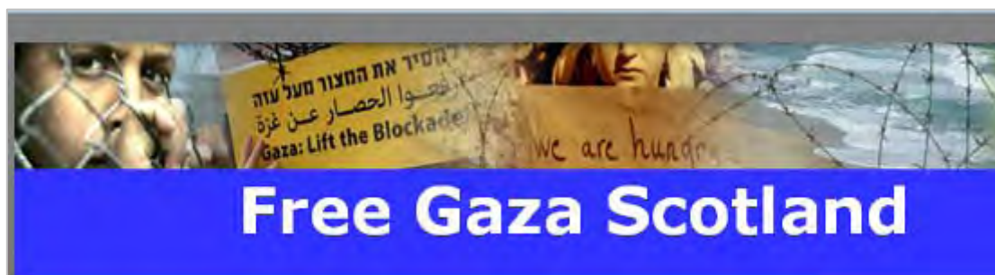
Free Gaza Scotland

25. Free Gaza Scotland is a pro-Palestinian network centered in Edinburgh, affiliated with the FGM. It represents itself as using "non-violent direct action" to bring