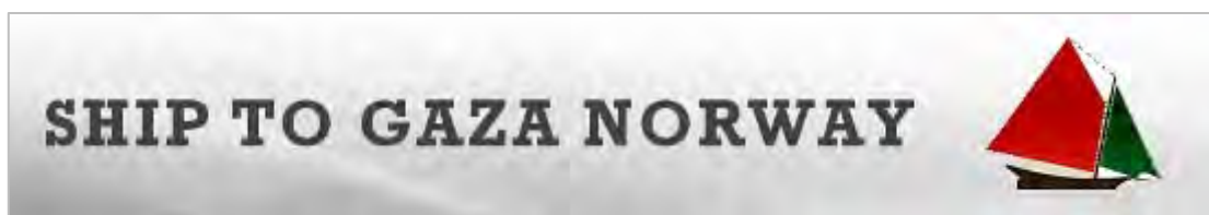
Ship to Gaza Norway