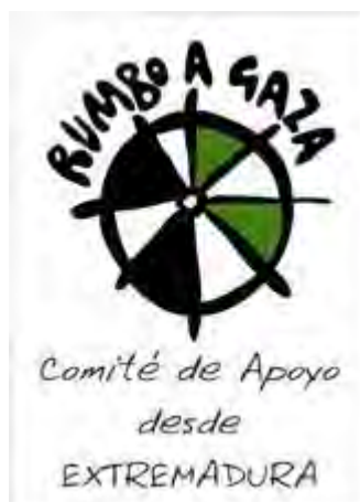
Rumbo a Gaza

39. Rumbo a Gaza is a network of pro-Palestinian Spanish activists whose stated objective is to express solidarity with the residents of the Gaza Strip. Its website posts a list of 300 Spanish organizations which identify with the goal. It intends to send 200 activists and 2,000 tons of humanitarian assistance to the Gaza Strip , which on arrival will be transferred to UNRWA. Rumbo a Gaza intends to purchase two ships , and to that end has initiated a fundraising and propaganda campaign. There were three Spanish nationals aboard the Mavi Marmara , among them activists of an organization calling itself Culture, Peace and Solidarity, which will also take part in the upcoming flotilla (See below).