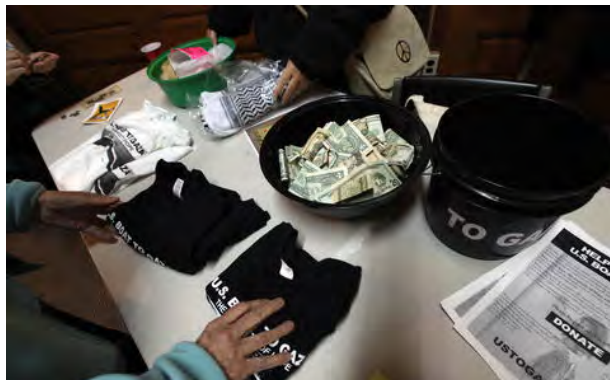
Raising money in the United States for the flotilla

human rights. The flotilla participants stated they would not use violence and that the ship's cargo would be open to international inspection. 14