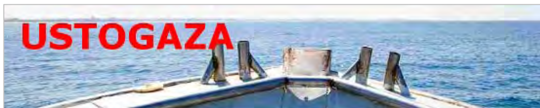
US Boat to Gaza