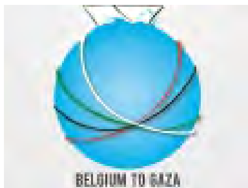
Belgium to Gaza

33. Belgium to Gaza is a network of pro-Palestinian Belgian organizations and activists wanting to join the flotilla to "lift the siege" of the Gaza Strip. It is conducting a media campaign to purchase a ship costing €300,000. Belgium to Gaza is linked to the FGM. There were three Belgian women registered to sail with in the previous flotilla aboard the Mavi Marmara , one of whom changed her mind at the last minute.