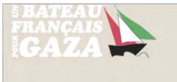
Un Bateau Français pour Gaza

52. Un Bateau Français pour Gaza is a French network established for the flotilla, composed of several dozen French organizations. Its website enlists contributions for a French ship planned to set sail from Marseille. As of May 19, 2011, 172 signatures had been collected. Among the passengers there will apparently be members of political parties and trade unions.