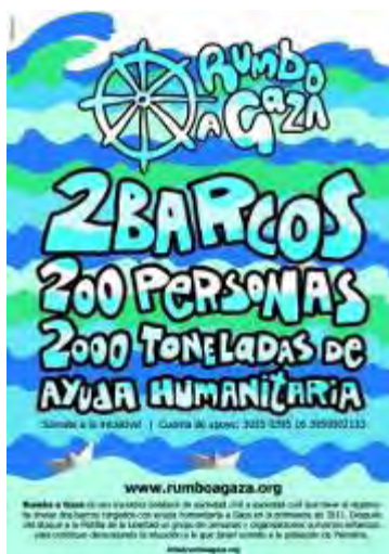
Recruiting poster for the flotilla: "[On a] course for Gaza: two ships, 200 people, 2000 tons of humanitarian assistance."

41. The organization's activists include musicians, actors, union members and social activists. According to its website, two of its activists participated in the Mavi Marmara flotilla. They were: