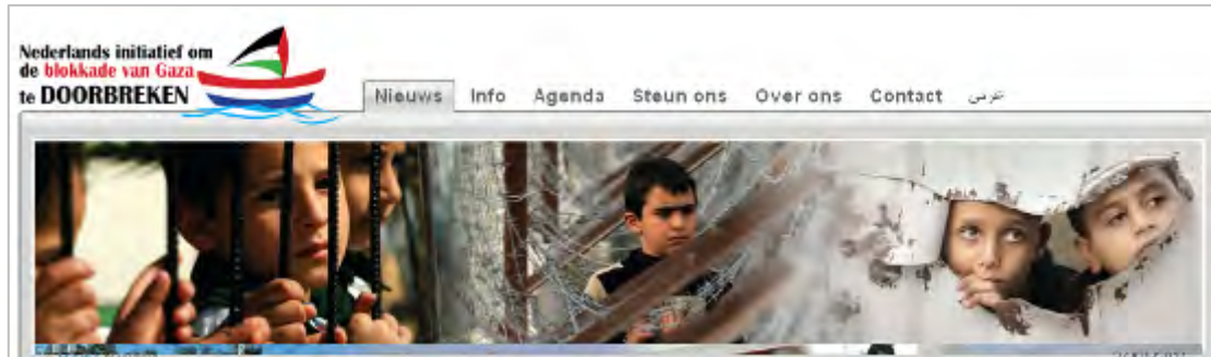
Netherlands Boat to Gaza

37. Netherlands Boat to Gaza is a network of dozens of organizations established to "lift the siege" of the Gaza Strip. It has a Facebook page with 500 friends. Its website calls for supporters who can organize fundraising or other events, and asks for donations for the flotilla – mainly drugs, medical equipment and school supplies – and for contributions to purchase a ship or equipment for the residents of the Gaza Strip.