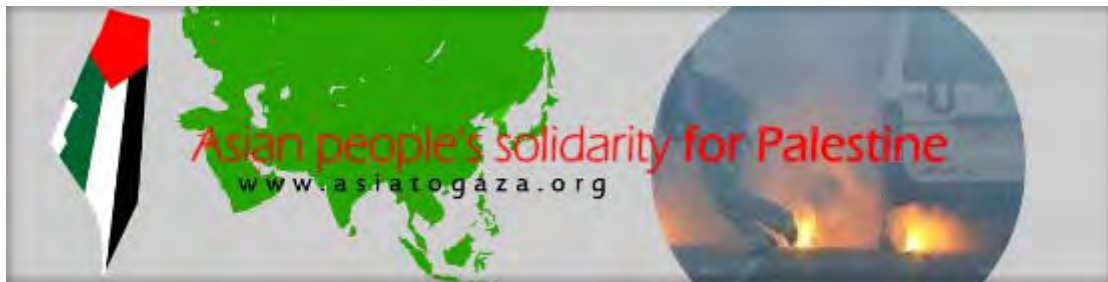
Asian People's Solidarity for Palestine

66. Asia to Gaza is affiliated with the Asian People's Solidarity for Palestine (ASPS) network, whose objective is to "break the siege" of the Gaza Strip. The APSP is hostile to Israel, rejects Israel's legitimacy, and supports the so-called "resistance" (i.e., terrorism). It is based in India but has activists from other Asian countries. The APSP is affiliated with the FGM.