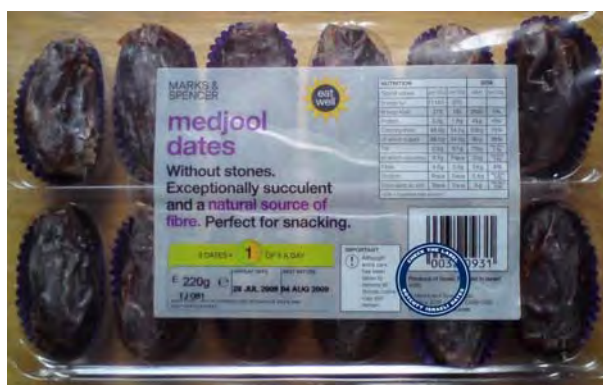
Droit Pour Tous, Geneva branch, call to boycott Israeli products (aqsa.org.uk website)