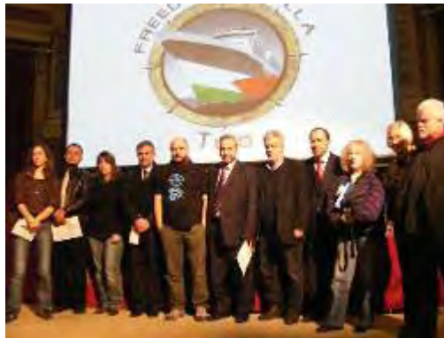
The members of the steering committee meeting in Rome.

4. These three core organizations, IHH, ECESG and FGM, determine policy and strategies for the upcoming flotilla (as they did for the Mavi Marmara ). That is done through a steering committee set up to organize the flotilla, which holds occasional coordination meetings attended by senior activists of the three core and other anti-Israeli organizations. To date meetings have been held in Athens, Paris, Amsterdam, Madrid and Rome.