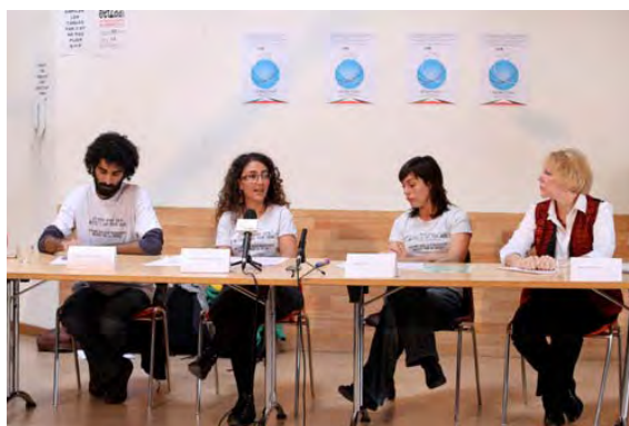
Belgium to Gaza activists hold a press conference

33. Belgium to Gaza is a network of pro-Palestinian Belgian organizations and activists wanting to join the flotilla to "lift the siege" of the Gaza Strip. It is conducting a media campaign to purchase a ship costing €300,000. Belgium to Gaza is linked to the FGM. There were three Belgian women registered to sail with in the previous flotilla aboard the Mavi Marmara , one of whom changed her mind at the last minute.