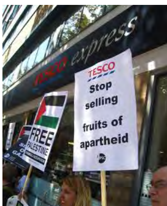
PSC activists demonstrate for a boycott of the "fruits of apartheid." The demonstration was held in front of a Tesco supermarket.