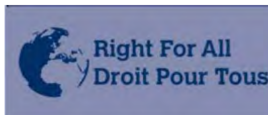
Droit Pour Tous

28. Bateau Suisse Pour Gaza is a network based on a Swiss NGO called Droit Pour Tous. Droit Pour Tous belongs to the ECESG , and claims to seek justice for people around the world. In reality, it focuses on the Palestinian issue and the "Palestinian rights" in