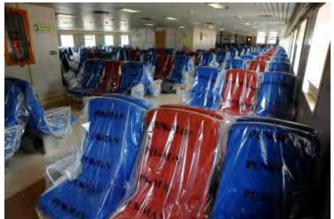
The renovated Mavi Marmara , which will again be the IHH flagship (IHH website, May 22, 2011). Five hundred passengers, from Turkey and other countries, are expected to participate.