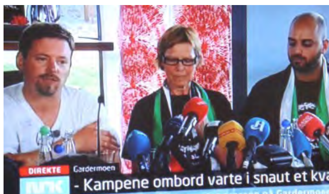
A press conference held in Oslo by three Norwegian activists who were aboard the Mavi Marmara flotilla.