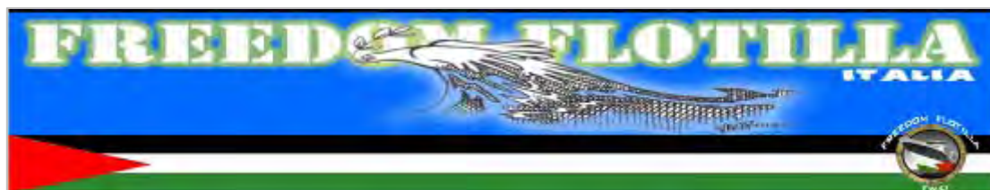
Freedom Flotilla Italia

36. Freedom Flotilla Italia is a network of organizations, unions and individuals who joined one another to have an Italian ship join the flotilla. It has representatives in a number of Italian cities. It intends to sail aboard the Stefano Chiarini , named after an