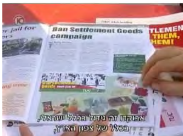
From the PSC newsletter: a call to boycott Israeli goods, even those not produced in the territories, such as dates and avocados grown in northern Israel.