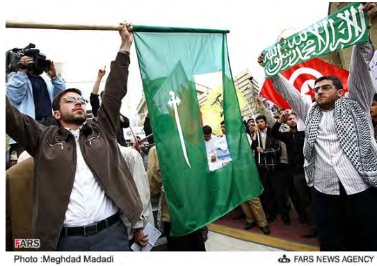
Protest demonstration in front of the Saudi embassy in Tehran (April 11)

The daily accused Saudi Arabia of acting in service of the West to instigate a conflict between Sunnis and Shi'ites instead of playing a role in the establishment of Islamic unity. The daily also accused the rulers of Saudi Arabia of helping the West promote the campaign designed to demonize Iran, giving Israel the go-ahead to continue the massacre in Gaza, the West Bank, and Jerusalem, and playing a part in the attempt to weaken the resistance front led by Iran, Syria, and Lebanon in accordance with the desires of the Zionists and the West. The daily warned the rulers of Saudi Arabia that their current policy does not serve the interests of their country. For Saudi Arabia to be able to fulfill its true role in the region, it needs to stop serving Western interests, distance itself from Western and Zionist schemes, and abandon its current policy in light of the regional developments. This policy will likely escalate the crisis and isolation facing Saudi Arabia, and only by changing its policy will it be able to restore its regional and global status and regain the sympathy of the public (Siasat-e Rouz, April 11).