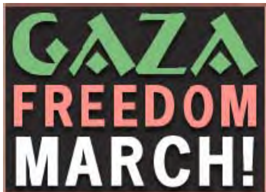
The logo of the Canadian organization (Organization website, July 27, 2010).