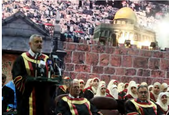
Ismail Haniya, head of the de facto Hamas administration, speaks as the Islamic University in Gaza ( Hamas' Palestine-info website, July 25, 2010).

an international court and help lift the siege of the Gaza Strip ( Hamas' Al-Aqsa TV, July 25, 2010).