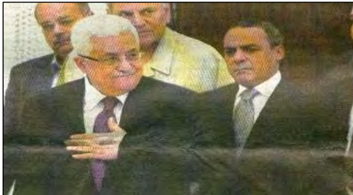
Mahmoud Abbas at a meeting of Fatah's Revolutionary Council in Ramallah (Al-Quds, July 21, 2010).