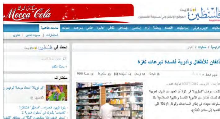
The Felesteen article as it appeared on the Internet, July 21, 2020.

■ An Al-Jazeera TV correspondent in the Gaza Strip revealed that the heads of the health ministry of the de facto Hamas administration in the Gaza Strip were angry because 70% of all the medicines which were brought into the Gaza Strip from various countries, especially the Arab countries, could not be used. They were either spoiled or had passed their expiry dates by months and sometimes years. It was also reported that one of the convoys had brought useless dialysis machines. The report was also quoted by Hamas de facto administration-affiliated Felesteen (Al-Jazeera TV, July 20 2010).