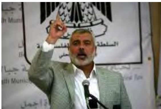
Haniyeh's speech at the street naming ceremony (Palestine-info, July 15, 2010)

6. This is not the first time that Hamas has expressed sympathy with Al-Bashir. When the first arrest warrant was issued against him for crimes against humanity and war crimes, Hamas called on Arab countries and the world of Islam to stand up for Al-Bashir and Sudan against the “unfair attack on it”. Hamas declared “unequivocal solidarity” with the president, rejecting the “unfair allegations against him”. According to Hamas, those allegations serve a system of international justice that “reflects the interests of the US and ignores the doings of the true criminals”, i.e., Israel (Aqsaa.com, July 15, 2010).