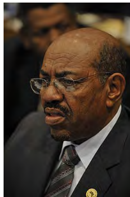
Sudan's President Omar al-Bashir

2. Hamas' support for the president of Sudan despite the serious genocide allegations, as well as its harsh statements against the international system of justice, is all the more notable considering Hamas' worldwide efforts to undermine the legitimacy of the State of Israel and its leaders. Those efforts include making use of international and country-specific systems of justice to sue Israeli top officials.