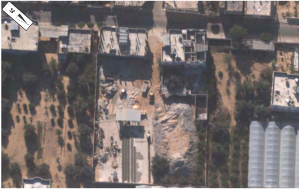
Cement factory owned by Hamas

c. Use of Israeli construction materials —Hamas makes use of construction materials from Israeli population centers abandoned during the disengagement. For that purpose, Hamas dismantles formerly-populated Israeli buildings.