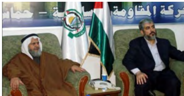
Khaled Mash'al at the conference of Arab parties in Damascus (Flesteen al-Aan, November 12, 2009)