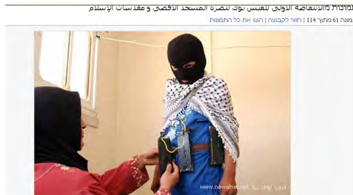
Terrorism-supportive messages on the Facebook group: a mother straps an explosive belt on her son, who is wearing a mask

11. For the Palestinians, using the web allows a direct connection between the Gaza Strip, controlled by Hamas, and Judea and Samaria, controlled by the PA. It also enables the Palestinians to maintain contacts with countries in the Middle East and elsewhere in which radical Islamic and terrorist elements exist. In addition to the propaganda implications, it is also a convenient platform for incitement . The target audience of such networks are usually young people who can be influenced by those messages . This may allow radical Islamic and terrorist elements to incite young people for violations of public order in Judea and Samaria, specifically on the Temple Mount .