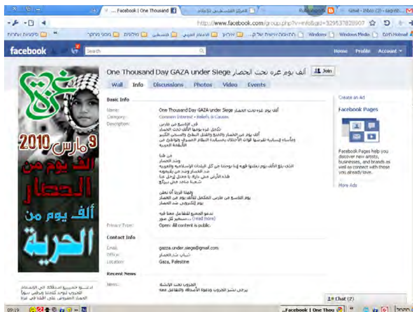
The group supporting Gaza on Facebook

9. As part of the “electronic day” events, a new Facebook was created which is called “Gaza under siege for 1,000 days”, in which members upload mostly videos and audio clips representing the “tragedy of the Palestinian people in the Gaza Strip, particularly during the latest Zionist war last year”. The number of group members has already exceeded four thousand. The group members have emphasized that “Gaza and the West Bank are two places in one country—Palestine, and that their salute to Gaza and to its firm stance will not make them forget what is happening in the Al-Aqsa Mosque and the attempts of the [Zionist] entity to turn it into a Jewish site” (March 6, 2010, Palestine-info).