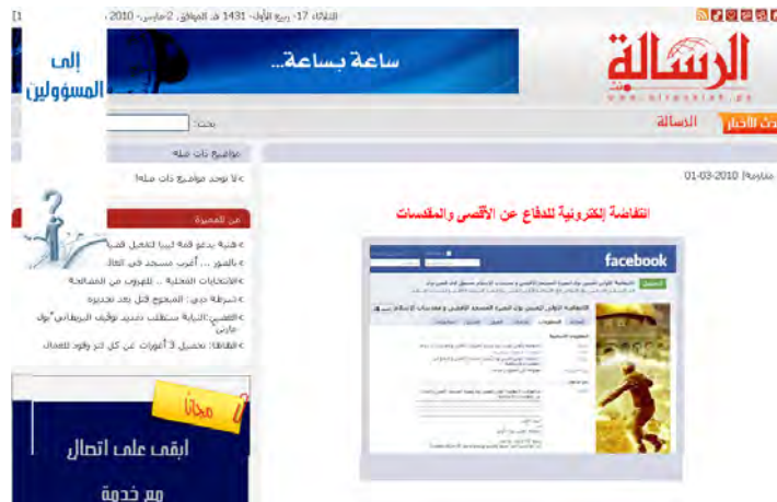
The article published on Hamas periodical Al-Resala (February 28, 2010)

5. The group members share texts, pictures, posters, videos, and various relevant links. The website features a video of a speech given by Ra'ed Salah, the head of the northern faction of the Islamic movement in Israel, at a convention called "Al-Aqsa in Danger". In the speech, Salah accuses Israel of terrorism and conducting excavations on the Temple Mount to establish the third temple there. 2 The group members also send each other messages on planned events, such as protest demonstrations, rallies, and conventions.