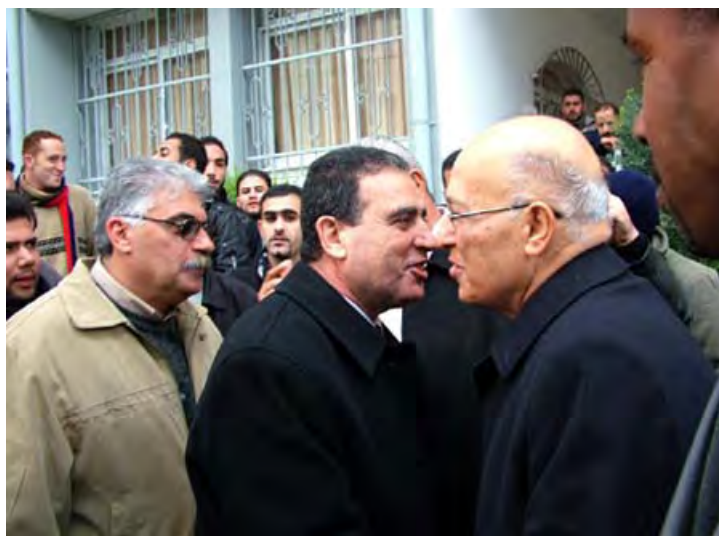
Nabil Shaath, senior Fatah figure, during an exceptional visit to the Gaza Strip (Wafa News Agency, February 3, 2010).