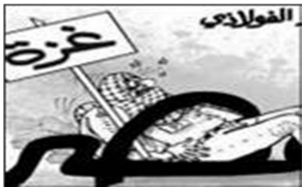
Hamas criticism of the Egyptian barrier ( Hamas' Filastin al-'Aan , January 4, 2010).