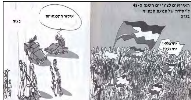
Cartoon protesting Hamas' ban on demonstrations in the Gaza Strip celebrating the 45th anniversary of the founding of Fatah. Left, the Gaza Strip, right, the West Bank (Al-Quds, January 3, 2010).

■ In the meantime, the Palestinian security forces continued their activities against Hamas-affiliated activists and targets throughout Judea and Samaria (Hamas' Palestine-Info website, January 4, 2010). The Palestinian Authority media reported Hamas' security forces had broken into the houses of Fatah activists in the Gaza Strip and detained many, including senior activists (Wafa News Agency, December 31, 2009). Hamas also continued its propaganda campaign against the PA.