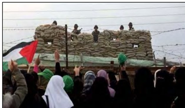
Women at the Rafah crossing protesting the barrier ( Filastin al-'Aan , December 29, 2009).