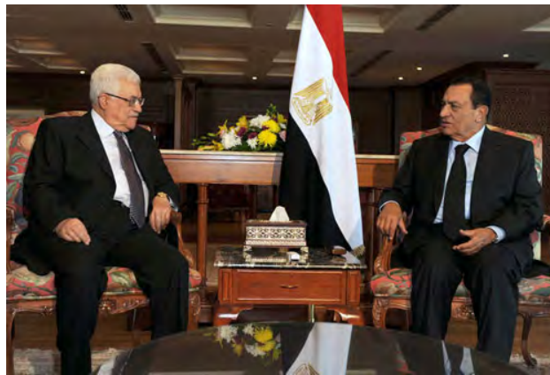
Egyptian President Hosni Mubarak meets with Mahmoud Abbas in Sharm el-Sheikh.