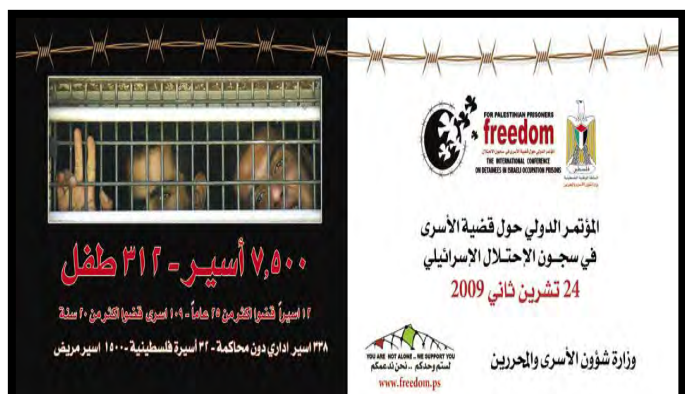
Prisoner affairs ministry announcement of the international conference to be held on November 24 ( Al-Ayyam , November 1, 2009).