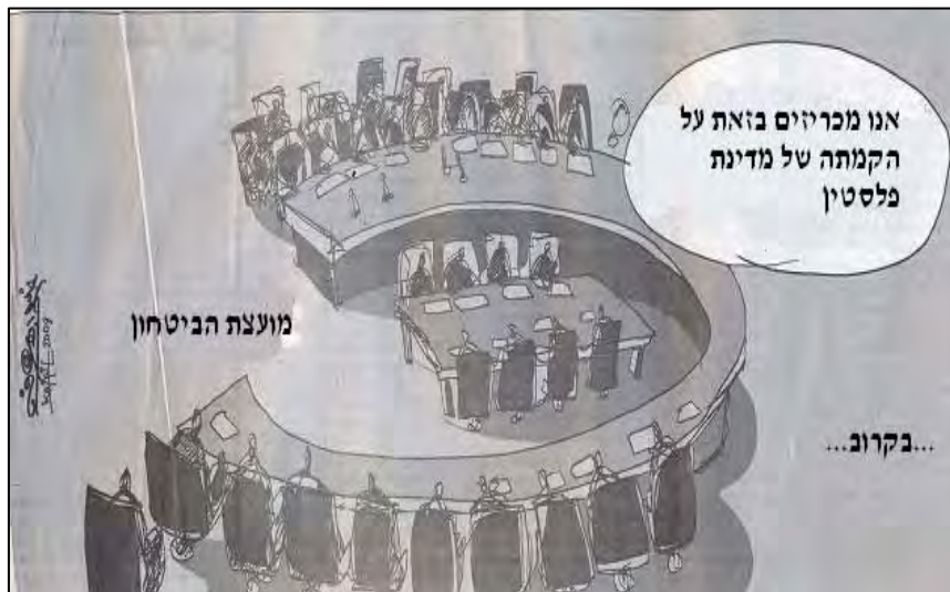
Cartoon expressing the idea of a unilateral declaration of a Palestinian state with the support of the UN Security Council. Left: "Security Council." Right: "We declare the establishment of a Palestinian state...soon" (Al-Quds, November 16, 2009).