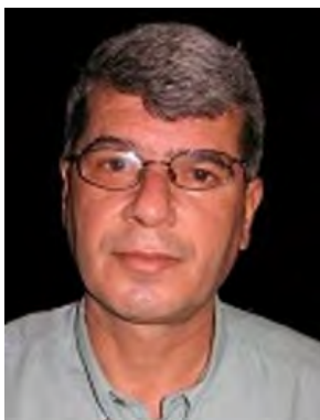
Issa Qaraqi, Palestinian Authority minister of prisoner affairs ( Al-Asraa Center website , November 2, 2009).

■ According to reports, 40 representatives and jurists will come from Spain, Canada, Britain, Ireland, South Africa and Sweden. There will also be members of the European Parliament and the Arab League, UNICEF and correspondents from various countries. Qaraqi said that a committee would be appointed to monitor the condition of the prisoners and that international legal means would be used to protect them. He said that another objective of the conference was to bring to trial senior Israel's for so-called "war crimes" and "violations" [of international law] since the beginning of the "occupation." According to reports the Palestinian Parliament ratified the prisoner affairs ministry's request to hold the conference and to support it in any way necessary (Palestinian News Network, November 11, 2009).