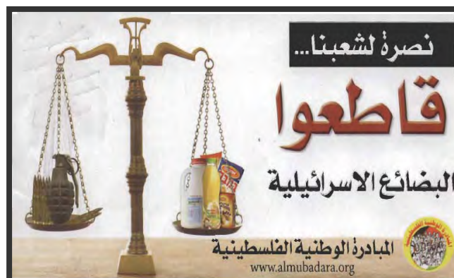
Flyer recently distributed in Judea and Samaria by a group named the "Palestinian National Enterprise," calling for a boycott of Israeli products.