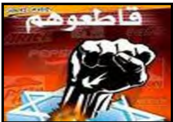
Call for a boycott of Israel (PLO Executive Committee website, March 2009).

■ The group's activity is apparently part of a much broader Palestinian campaign which has gained momentum in the past months, calling for a boycott of products and merchandise from within the Green Line as well as from the settlements in Judea and Samaria. The campaign is led by a group calling itself the "Boycott Israel Campaign" and includes elements affiliated with the Palestinian Authority , such as the Palestinian women's association and the Palestinian civil servants union.