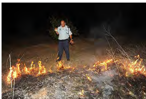
Left: Remains of the rocket fired at Kiryat Shemonah. Right: The fire caused by the rocket hit (Photos by Avi Shapira, reproduced courtesy of Ynet, October 27, 2009).

■ At 18:50 on the evening of October 27 a rocket, apparently 107mm, was fired into Israeli territory from the area of Wadi Jamal near the Shi'ite village of Houla in the central sector of south Lebanon. The rocket hit was identified in an open area near the northern Israeli city of Kiryat