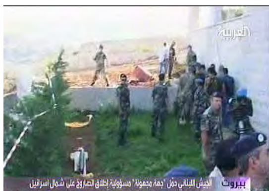
Searching the yard in Houla (Al-Arabia TV, October 28, 2009).

■ Immediately after the rocket fire UNIFIL and Lebanese army forces arrived to investigate the incident. According to a statement from the Lebanese army, the following morning four additional rockets ready for firing were discovered at the launching site. They were found in the yard of a house under construction on the outskirts of the village of Houla. The house belonged to Houla mayor Feisal Hejazi (Lebanese News Agency, October 28, 2009). Interviewed on television, Feisal Hejazi claimed to have been surprised that the rockets were found in his yard, stating that they were apparently put there during the night (NTV, October 28, 2009).