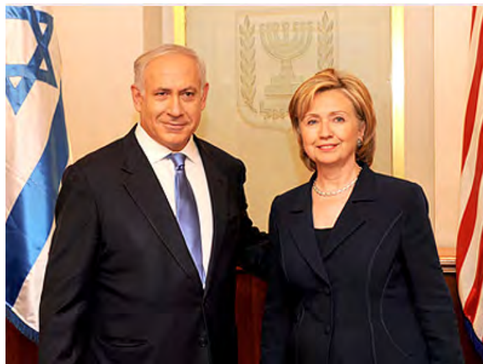
Israeli Prime Minister Benjamin Netanyahu and American Secretary of State Hillary Clinton hold a joint press conference.