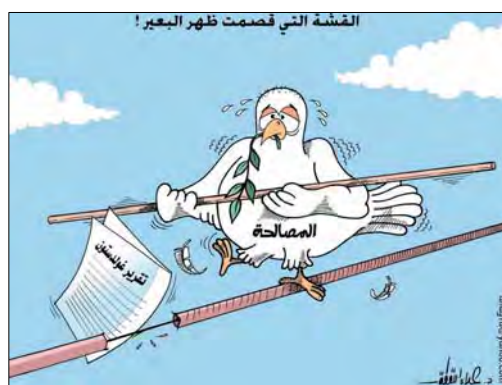
The caption reads "The straw that broke the camel's back." The dove is labeled "Reconciliation" [i.e., between Fatah and Hamas] and the Goldstone Report is about to cut the tightrope (Hamas' Felesteen, October 13, 2009).