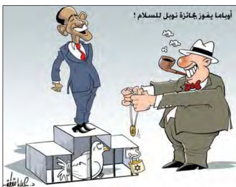
Obama receives the Nobel Peace Prize while the Dove of Peace is imprisoned at his feet (Hamas' Felesteen, October 11, 2009).

● The Obama administration: Khaled Mashaal said that at the beginning of its term the Obama administration used “a different language” and showed positive signs, but had not translated words into deeds. Obama, he said, had received the Noble Prize for flowery rhetoric and for promises which had not been kept: “The Obama administration gives words to us and deeds to our enemies,” and thus the Palestinians had no support in their struggle against Israel.