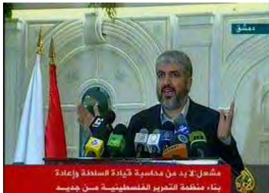
Khaled Mashaal speaking in Damascus.

He claimed that the Palestinian presidency was not legal and had not been since January 2009 according to Palestinian law. He said that [the issue of] the Goldstone Report had caused great anger and that it would therefore be impossible to hold the reconciliation meeting [scheduled for Cairo on October 24].