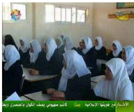
A delegation of the Hamas faction in the Palestinian Legislative Council visits schools in the Gaza Strip as the new school year begins (Al-Aqsa TV, August 23, 2009).