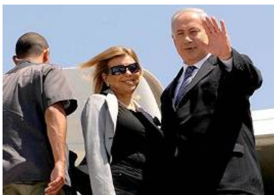
Israeli Prime Minister Benjamin Netanyahu leave for a meeting in London with American special envoy George Mitchell (Photo: Amos Ben-Gershon for the Israeli Government Press Office, August 24, 2009).