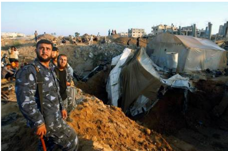
Hamas security forces guarding the smuggling tunnel struck by the Israeli Air Force on August 24. The attack came in response to mortar shells launched into Israel territory (Photo: Ibrahim Abu Mustafa for Reuters, August 25, 2009).