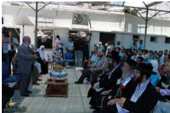
Delegation of pro-Palestinian activists, including members of the Naturei Karta, at a meeting with Ismail Haniya in Gaza.