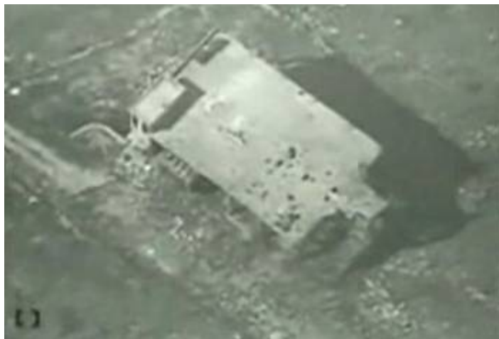
The abandoned building in Khirbet Silim after a Hezbollah weapons and ammunition store exploded (IDF Spokesman, July 16, 2009).