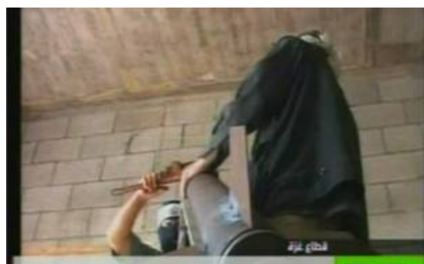
A correspondent from Russia Today TV visits a rocket manufacturing site. Left: A spokesman for the so-called Mujahideen Brigades holds a rocket, developed by the network (Russia Today TV, July 14, 2009).