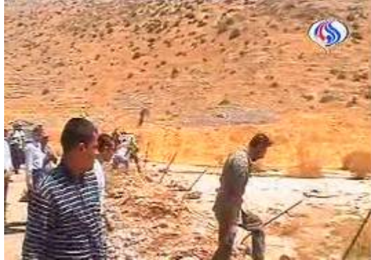
Lebanese demonstrators in the Shebaa Farms region (Al-Alam TV, July 18, 2009).

Lebanese and Hezbollah flags and returned to Lebanese territory. The IDF refrained from taking action against the demonstrators. UNIFIL soldiers near the area tried to prevent the provocation from deteriorating into a violent incident.