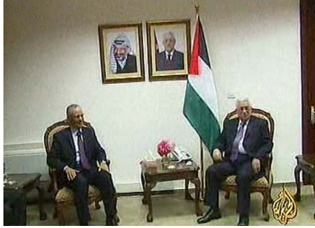
Palestinian Authority Chairman Mahmoud Abbas and the Egyptian envoy (Al-Jazeera TV, July 10, 2009).

compromise, but was unsuccessful. Both sides expressed pessimism regarding an additional round of talks on July 25, one of the Egyptian target dates. From statements made by Hamas activists it can be assumed that the movement does not regard July 25 as obligatory, but it has not ruled out a different date on condition that the issue of the Hamas operatives detained by the Palestinian Authority is resolved, which, according to Hamas claims, is the main obstacle to continuing the dialogue.