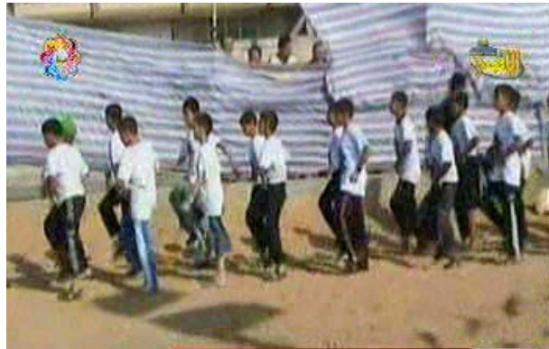
Hamas summer camps open throughout the Gaza Strip, a traditional means of indoctrinating Gazan youth (Al-Aqsa TV, July 4, 2009).