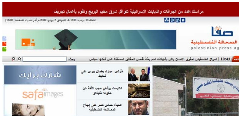
The homepage of the Safa news agency website (safa.sp, July 7, 2009).

resources and giving priority to rebuilding its media illustrate the importance Hamas gives to the battle for hearts and minds both with the Palestinian populations in the Gaza Strip and Judea and Samaria as well as abroad.