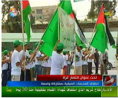
Hamas's summer camps open (Al-Aqsa TV, July 4, 2009).