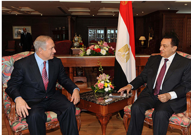
Israeli Prime Minister Benjamin Netanyahu and Egyptian President Hosni Mubarak (Israeli Government Press Office, May 11, 2009).