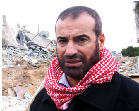
Fathi Hamad, new interior minister of the Hamas de-facto administration

■ Fathi Hamad, Hamas's new interior minister, reported on the "achievements" of his predecessor, Sayid Siyyam, who was killed in Operation Cast Lead, saying that "among his greatest achievements was the creation of collaboration between the current security forces and the Palestinian resistance [i.e., terrorist organizations]...which was established against the Zionist enemy...which is why [the enemy] bombed security force headquarters" (Hamas police website, May 7, 2009). His remarks again illustrate the close links between the security forces of the Hamas de-facto administration and the Izz al-Din al-Qassam Brigades, the organization's military-terrorist wing.