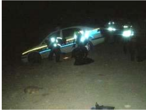
The scene of the terrorist attack near the community of Masua in the central Jordan Valley (Photo courtesy of Shlomo Gil, ZAKA spokesman, March 15, 2009)