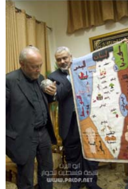
Ismail Haniya meets George Galloway. Right: George Galloway with a map of "Palestine" in the background from which any mention of Israel has been omitted ( Hamas's PALDF Forum, March 11, 2009).

■ On March 12 most of the members of the delegation left the Gaza Strip via the Rafah crossing on their way back to Britain (Middle East News Agency, March 12, 2009).