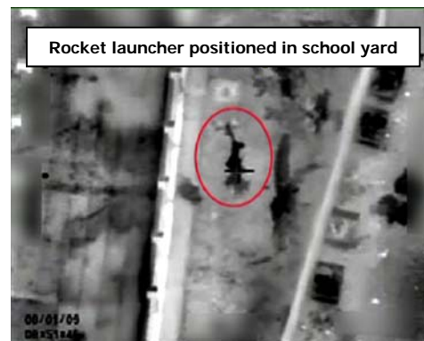
Rockets positioned near schools