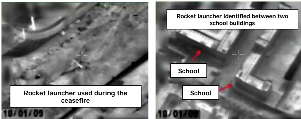
Rocket launcher aimed at Israel stationed between two school buildings in the Saja'iya neighborhood of Gaza City (IDF Spokesman, January 18, 2009).

4. In one instance, after the ceasefire, the Israeli Air Force identified a rocket launcher which had been used to fire rockets into Israeli territory. It was situated between two school buildings in the Saja'iya neighborhood, in eastern Gaza City. The Israeli Air Force did not attack the launcher because of its proximity to the schools.