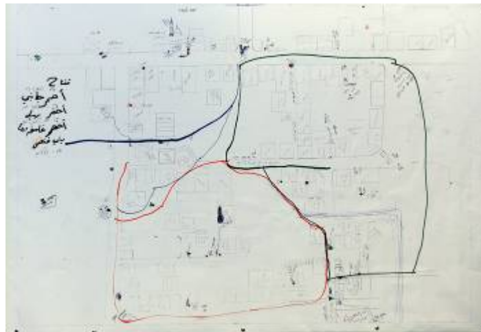
Sketch of the Al-Atatra neighborhood (IDF Spokesman, January 8, 2009).

4. The sketch of the Al-Atatra region (another preferred rocket launching zone) had a detailed legend showing IEDs and firing positions situated in densely-populated areas in the heart of the civilian population, another neighborhood in fact turned by Hamas into a military compound .